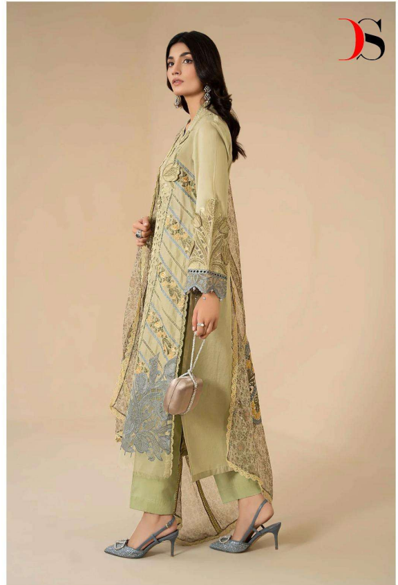
7016 ● ●