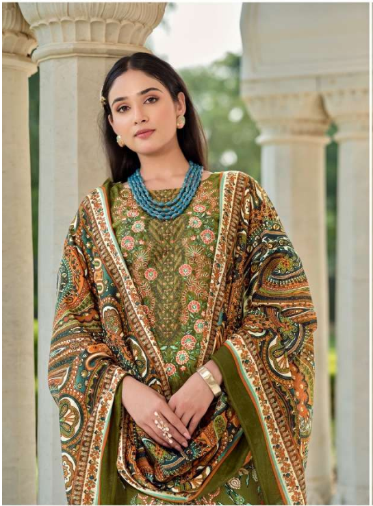
970-007 "What you wear is how you present yourself to the world, especially today, when human contacts are so quick. Fashion is instant language."