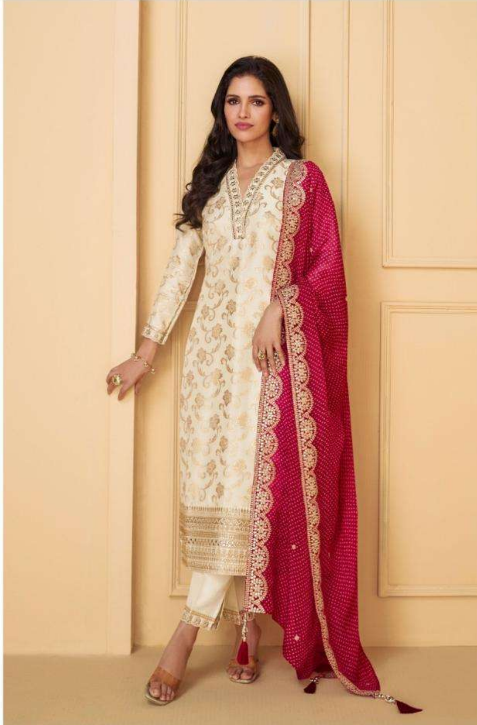
Candy Colored ————— D No-5571