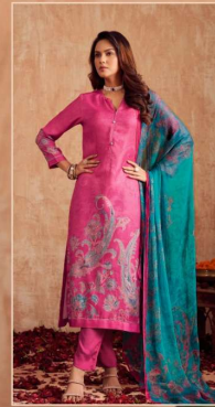
NIRAN | 1008

Let the rich hue of elevate your style & make you stand out!