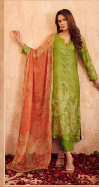
NIRAN | 1004