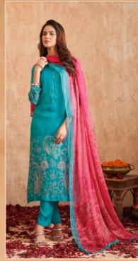
NIRAN | 1003