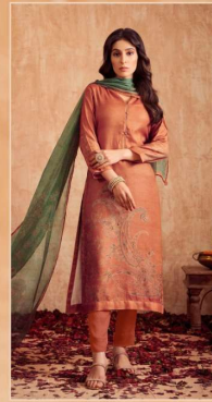
NIRAN | 1007