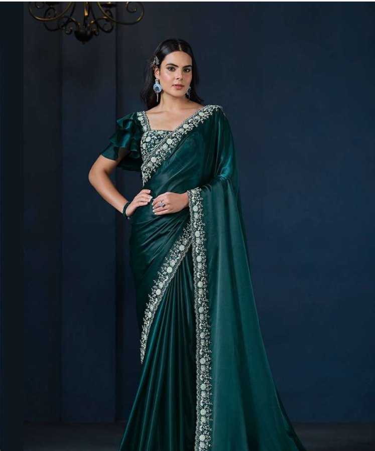
24515 FABRIC : CREPE SATIN SILK BLOUSE : EMBROIDERED