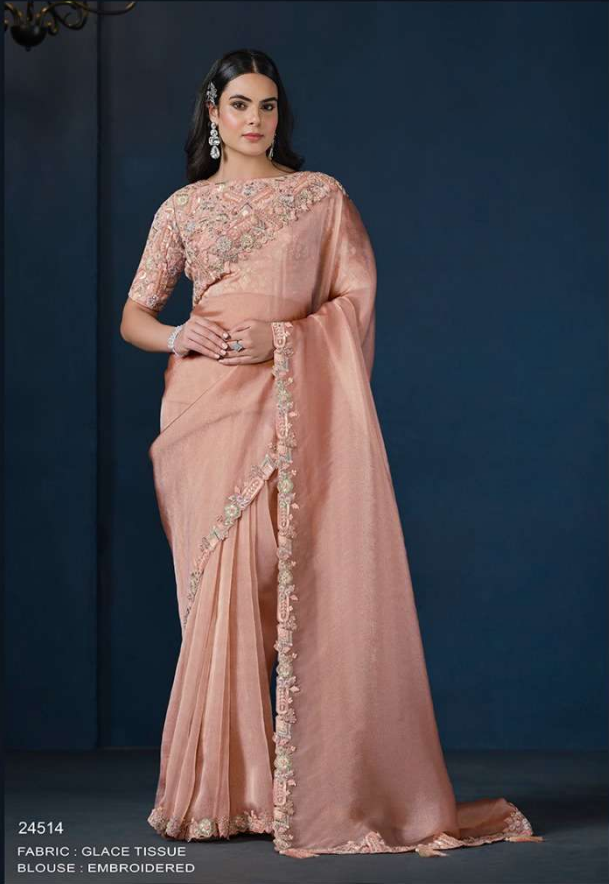
24514 FABRIC : GLACE TISSUE BLOUSE : EMBROIDERED