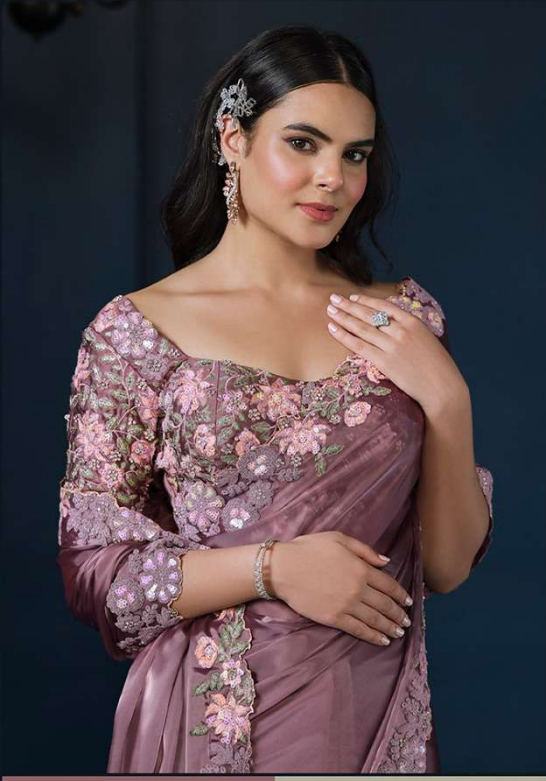
24518 FABRIC : CRAPE SATIN SILK BLOUSE : EMBROIDERED