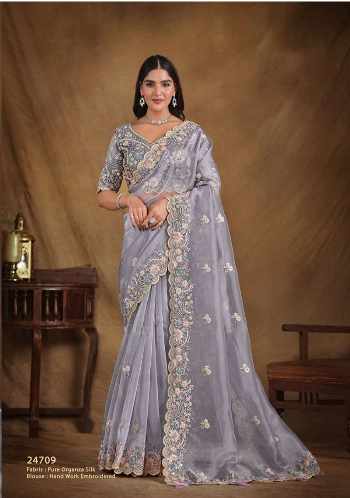
24709 Fabrics : Pure Organza Silk Blouse : Hand Work Embroidered