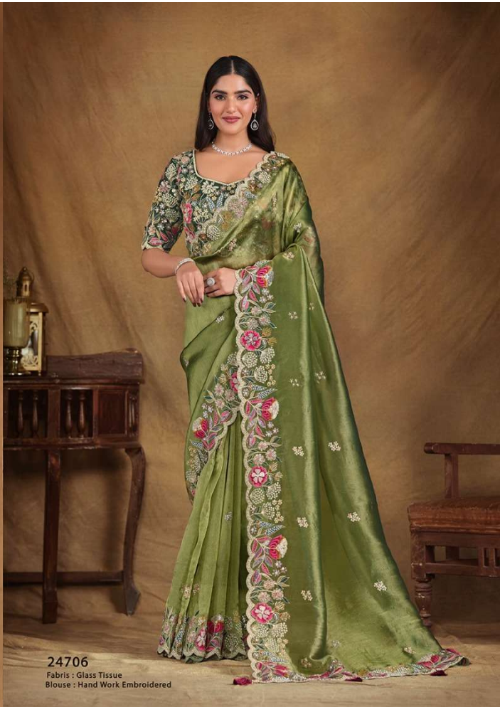
24706 Fabric : Glass Tissue Blouse : Hand Work Embroidered