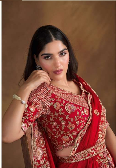
24710 Fabris : Two tone Satin Silk Blouse : Hand Work Embroidered