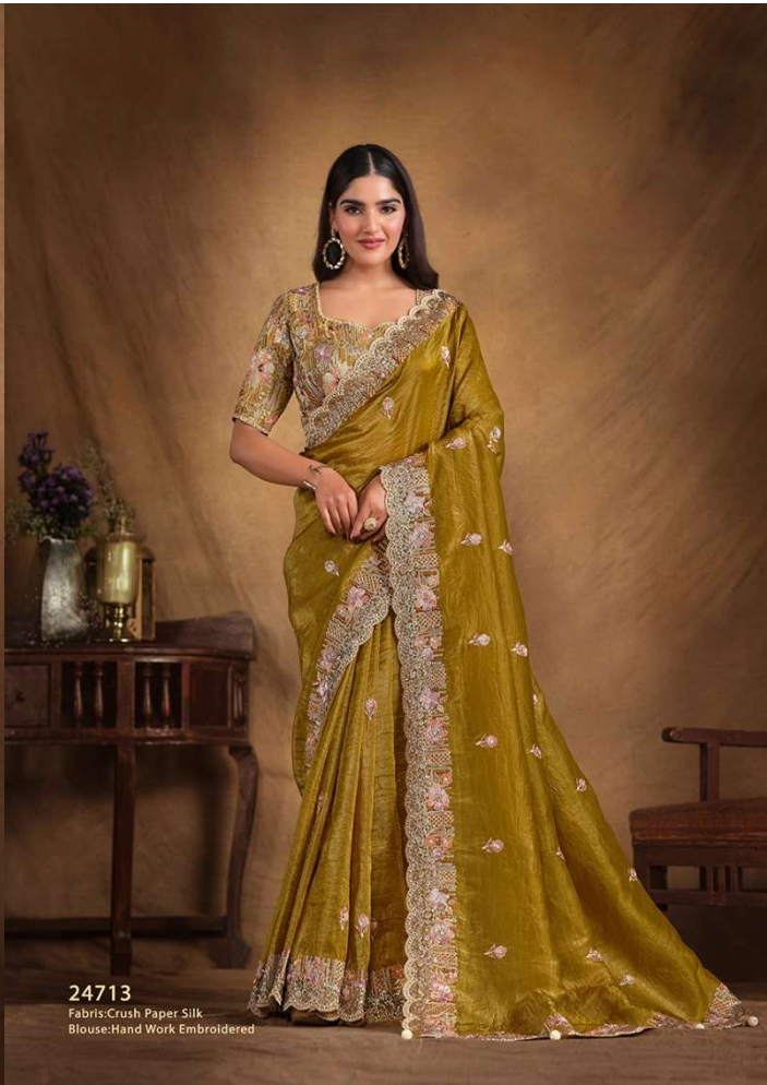
24713 Fabric:Crush Paper Silk Blouse:Hand Work Embroidered