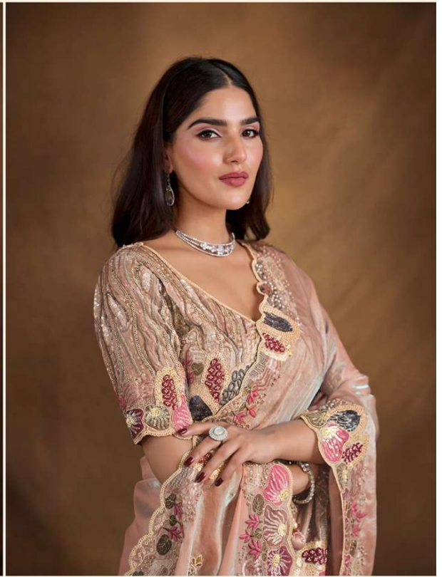
◆◆◆ 24712 Fabric: Two tone Satin Silk Blouse : Hand Work Embroidered