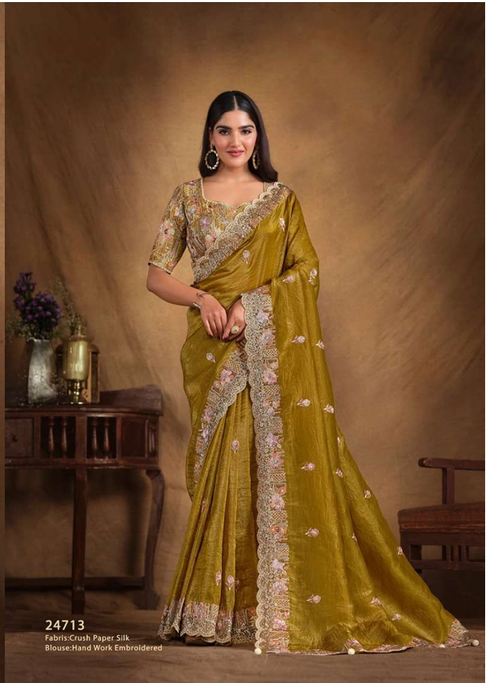
24713 Fabric:Crush Paper Silk. Blouse:Hand Work Embroidered