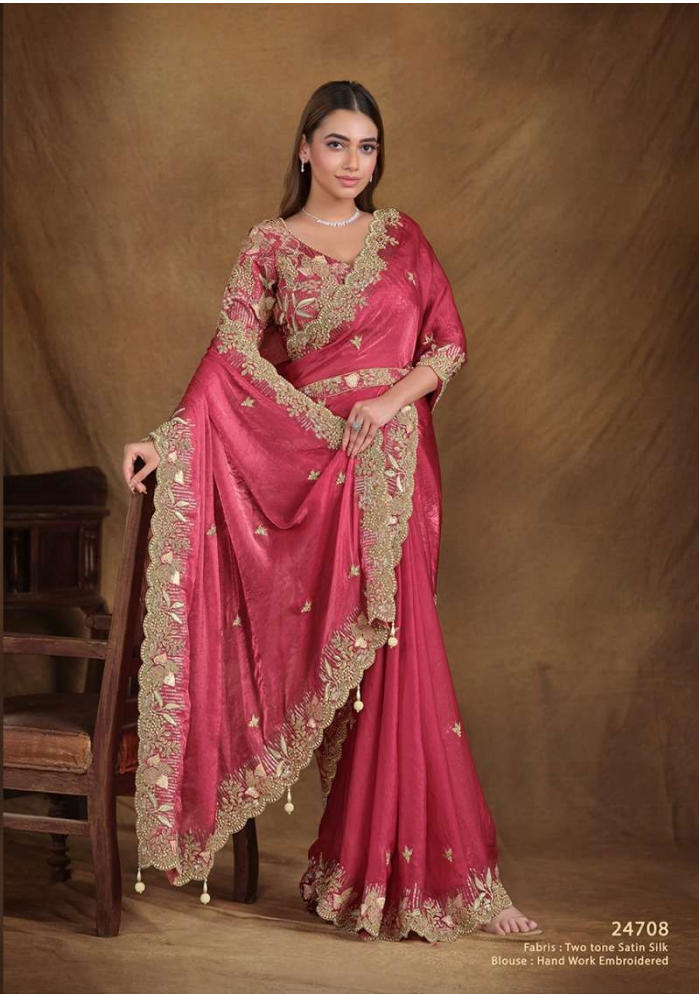
24708 Fabric: Two tone Satin Silk Blouse: Hand Work Embroidered