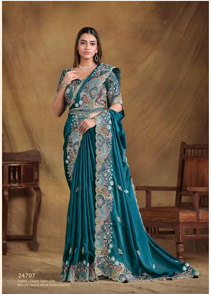
24707 Fabric : Crush Satin Silk Blouse : Hand Work Embroidered