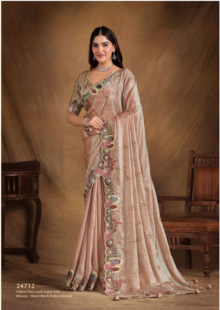
24712 Fabric: Two tone Satin Silk Blouse : Hand Work Embroidered