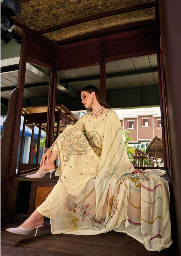
PLAYING DRESS-UP BEGINS AT AGE FIVE AND NEVER TRULY ENDS