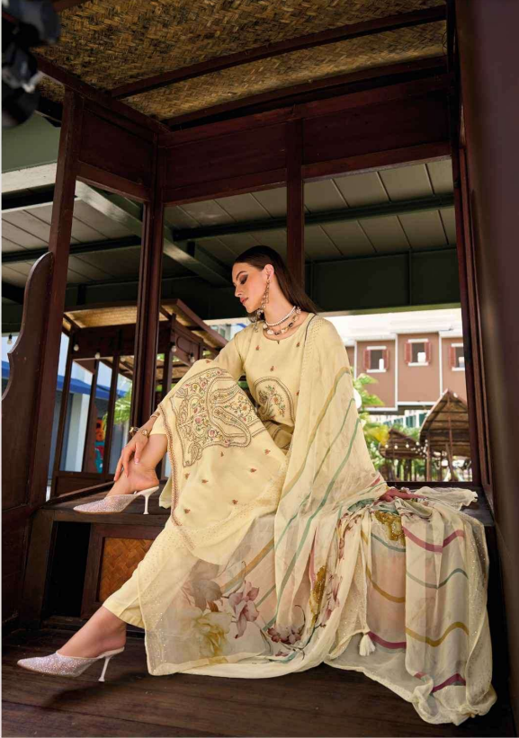
PLAYING DRESS-UP BEGINS AT AGE FIVE AND NEVER TRULY ENDS