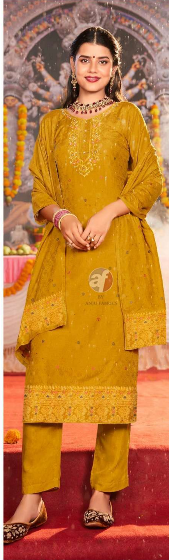
PALKI Vol-04 4042