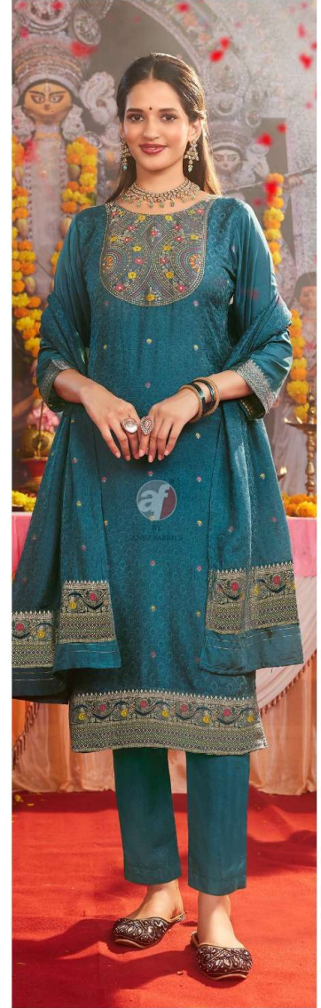
PALKI Vol-04 4043