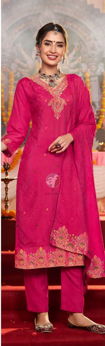
PALKI Vol-04 4041