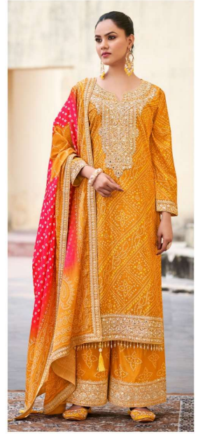
SHRINGAR | 3024