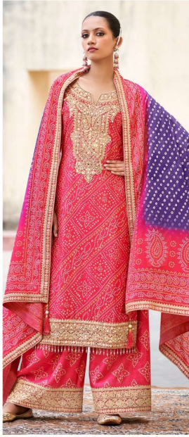
SHRINGAR | 3021