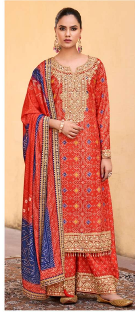
SHRINGAR | 3023