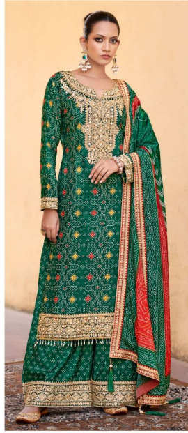
SHRINGAR | 3022