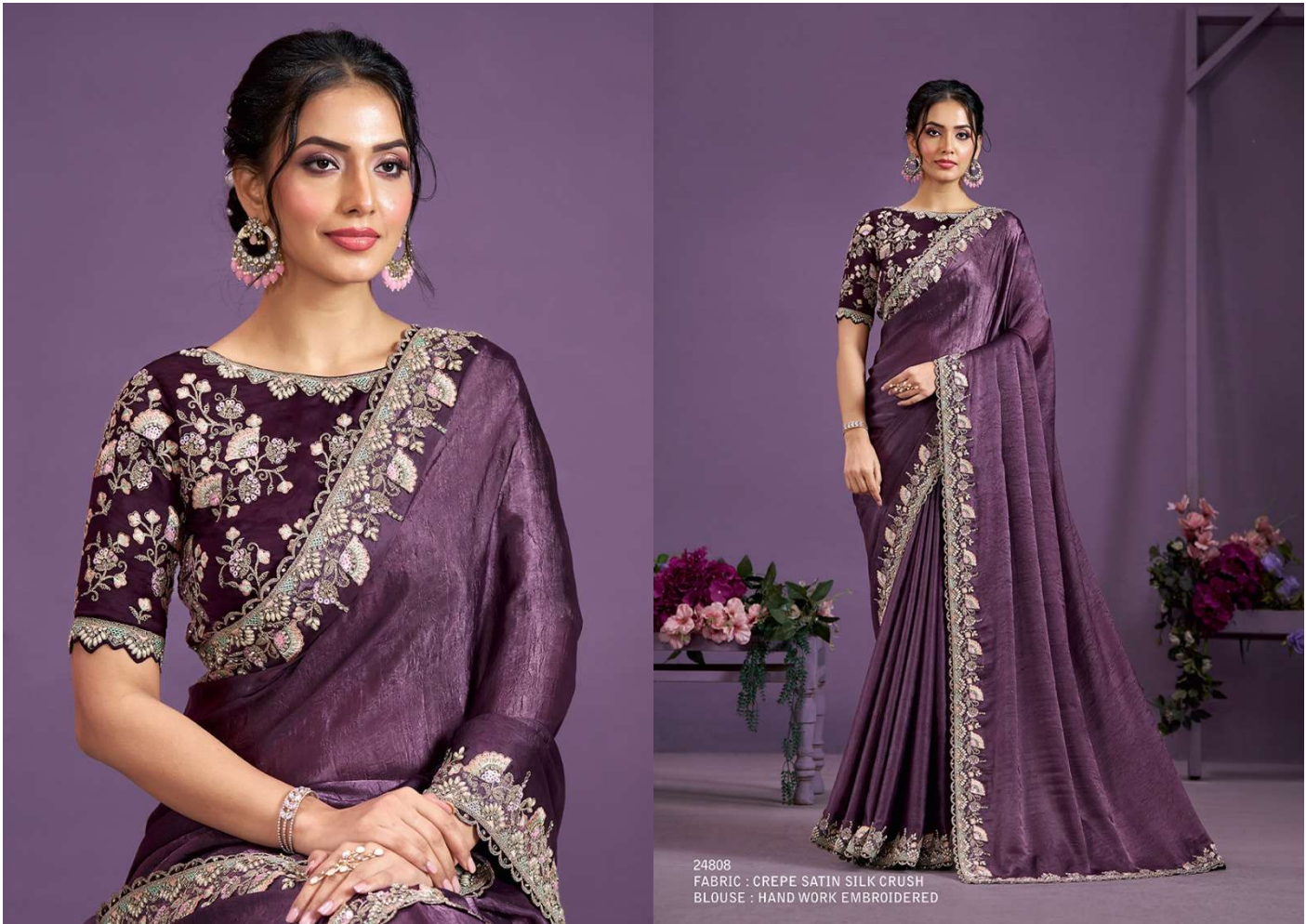
24808 FABRIC : CREPE SATIN SILK CRUSH BLOUSE : HAND WORK EMBROIDERED