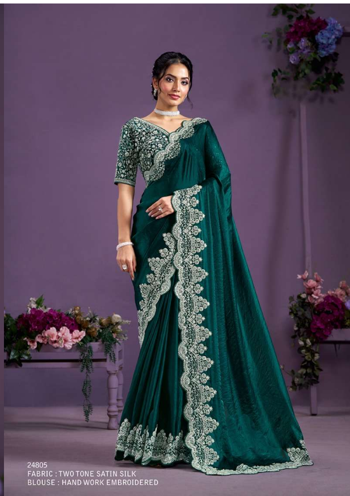
24805 FABRIC : TWO TONE SATIN SILK BLOUSE : HAND WORK EMBROIDERED