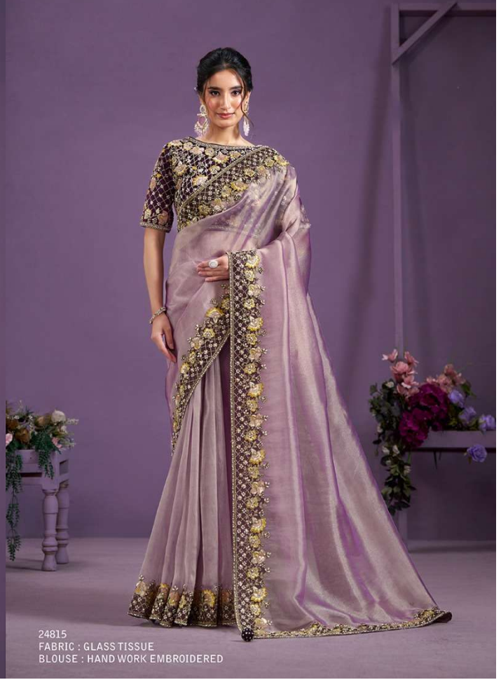
24815 FABRIC : GLASS TISSUE BLOUSE : HAND WORK EMBROIDERED