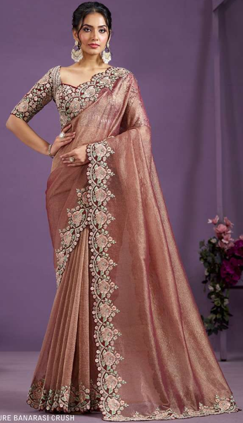
24806 FABRIC : PURE BANARASI CRUSH BLOUSE : HAND WORK EMBROIDERED