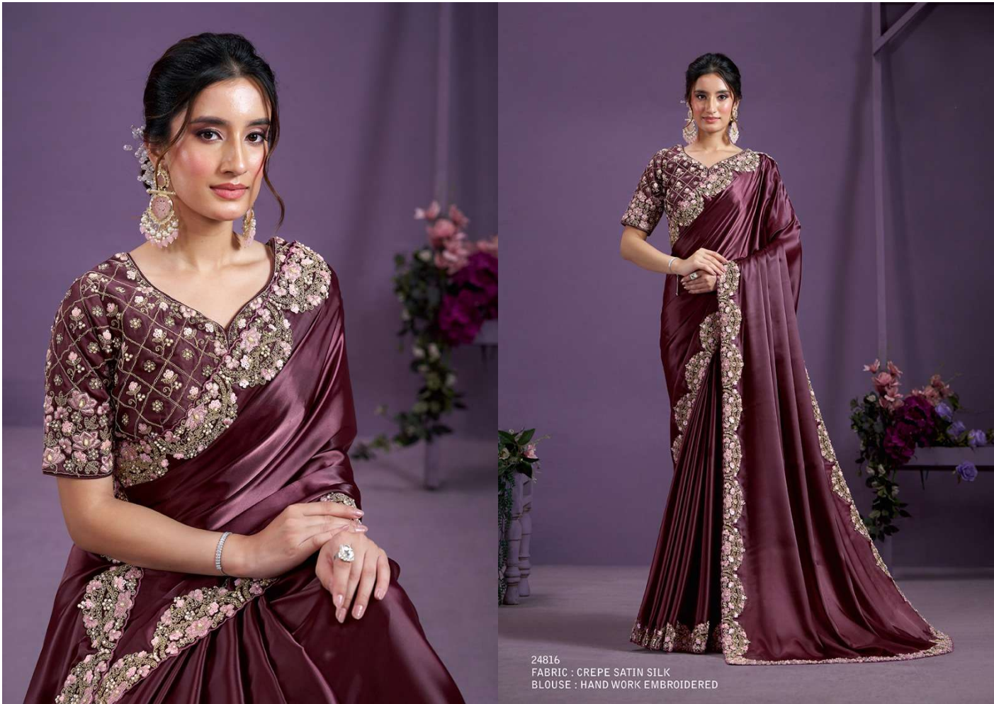
24816 FABRIC : CREPE SATIN SILK BLOUSE : HAND WORK EMBROIDERED