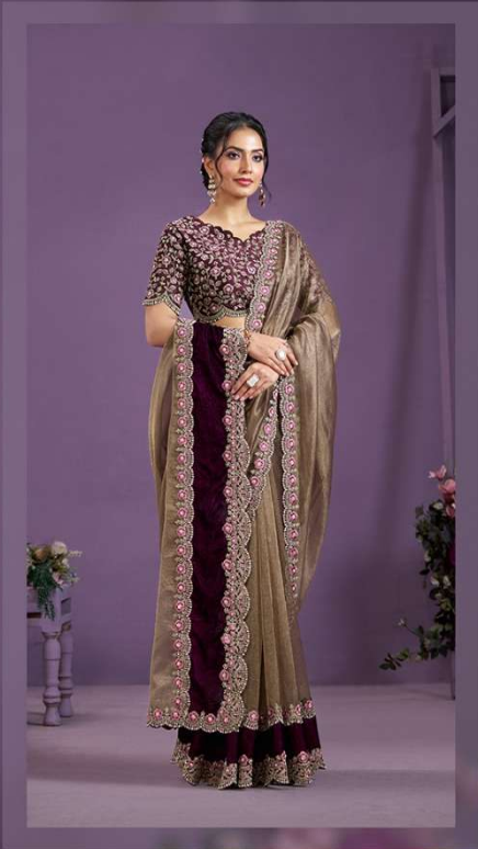
The HEAVY blouses are perfectly DESIGNED to match each SAREE, making sure that every OUTFIT LOOKS rich and SOPHISTICATED.