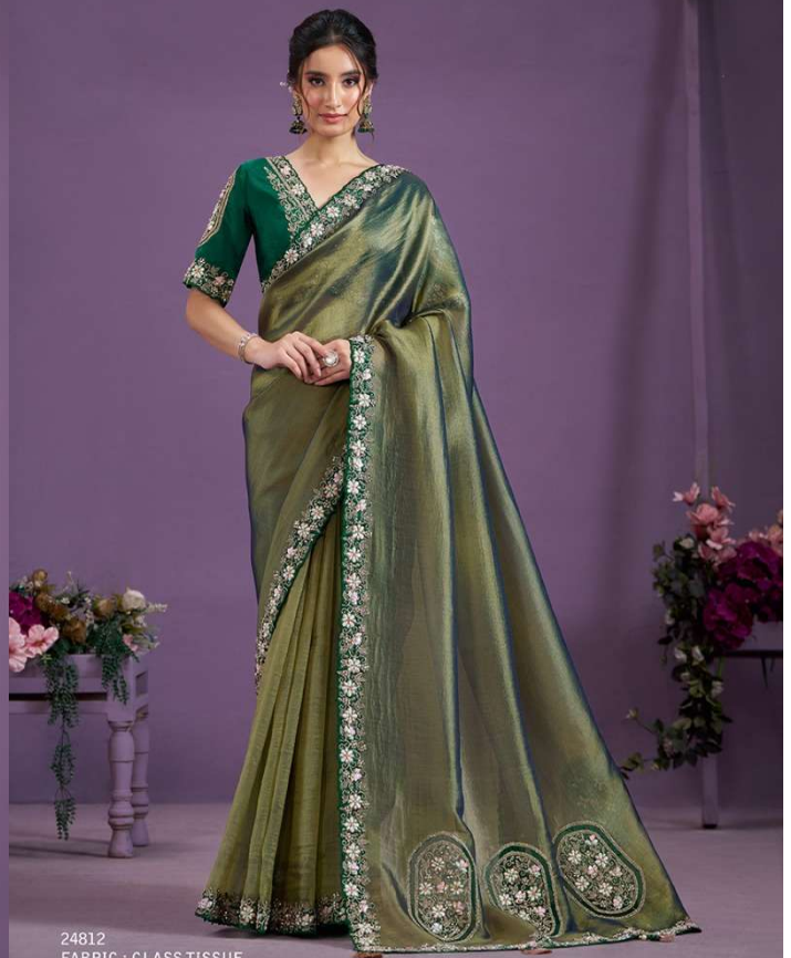
24812 FABRIC : GLASS TISSUE BLOUSE : HAND WORK EMBROIDERED