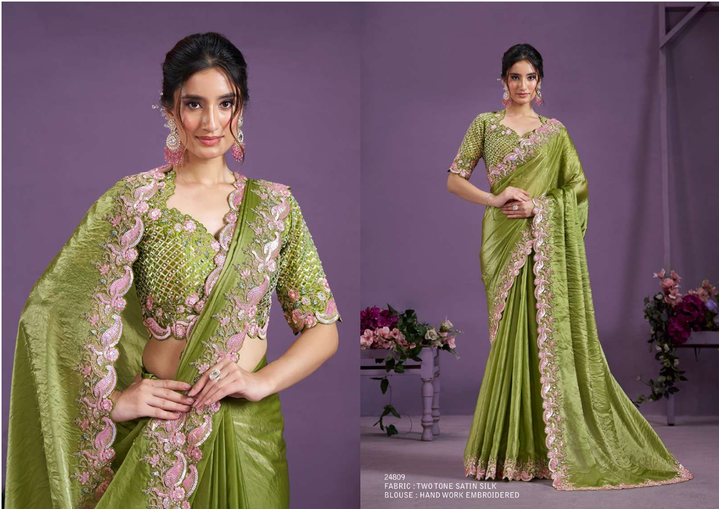
24809 FABRIC : TWO TONE SATIN SILK BLOUSE : HAND WORK EMBROIDERED