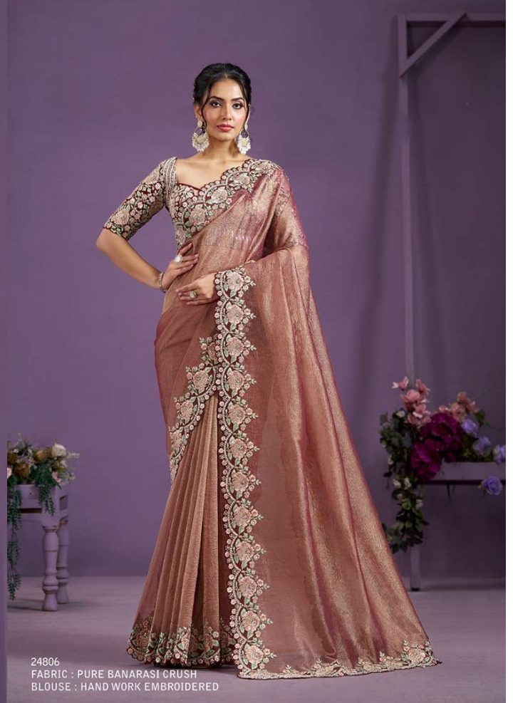
24806 FABRIC : PURE BANARASI CRUSH BLOUSE : HAND WORK EMBROIDERED