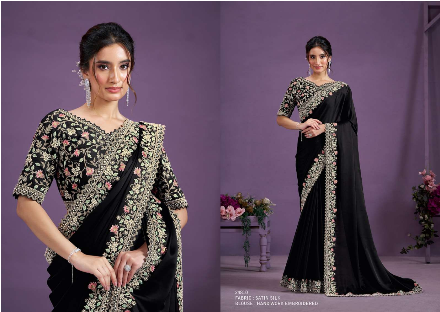
24810 FABRIC : SATIN SILK BLOUSE : HAND WORK EMBROIDERED