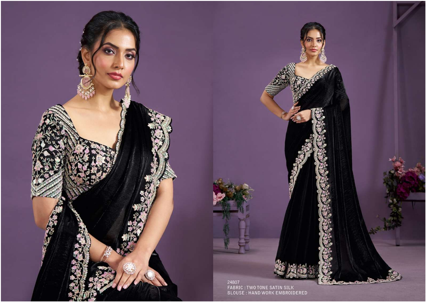
24807 FABRIC : TWO TONE SATIN SILK BLOUSE : HAND WORK EMBROIDERED