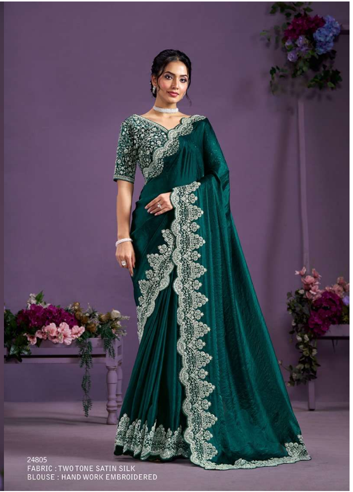
24805 FABRIC : TWO TONE SATIN SILK BLOUSE : HAND WORK EMBROIDERED