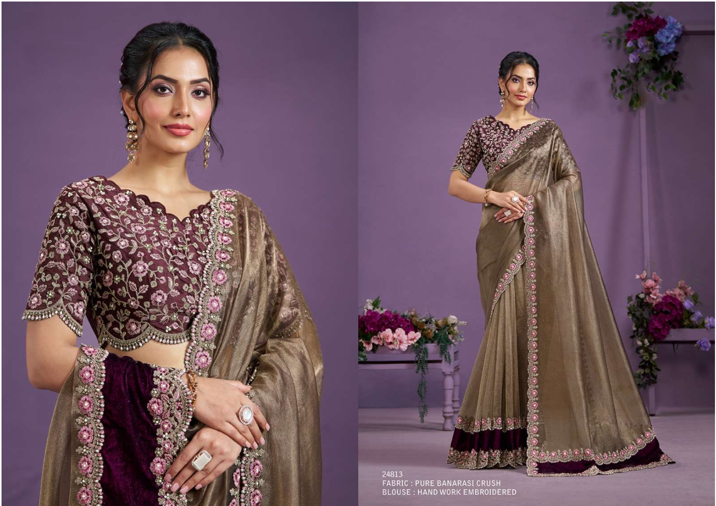
24813 FABRIC : PURE BANARASI CRUSH BLOUSE : HAND WORK EMBROIDERED