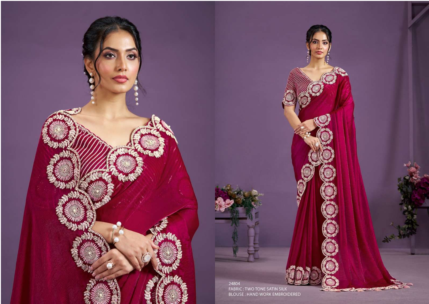
24804 FABRIC: TWO TONE SATIN SILK BLOUSE: HAND WORK EMBROIDERED