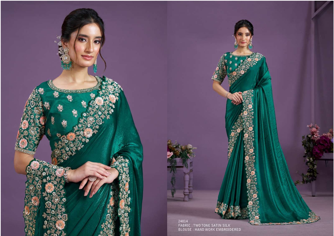
24814 FABRIC : TWO TONE SATIN SILK BLOUSE : HAND WORK EMBROIDERED