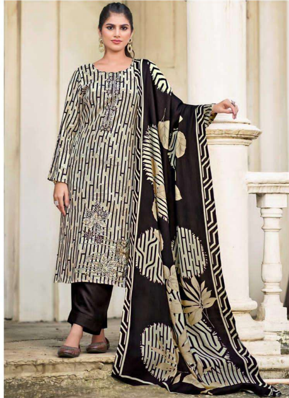
3004 | Hoonar