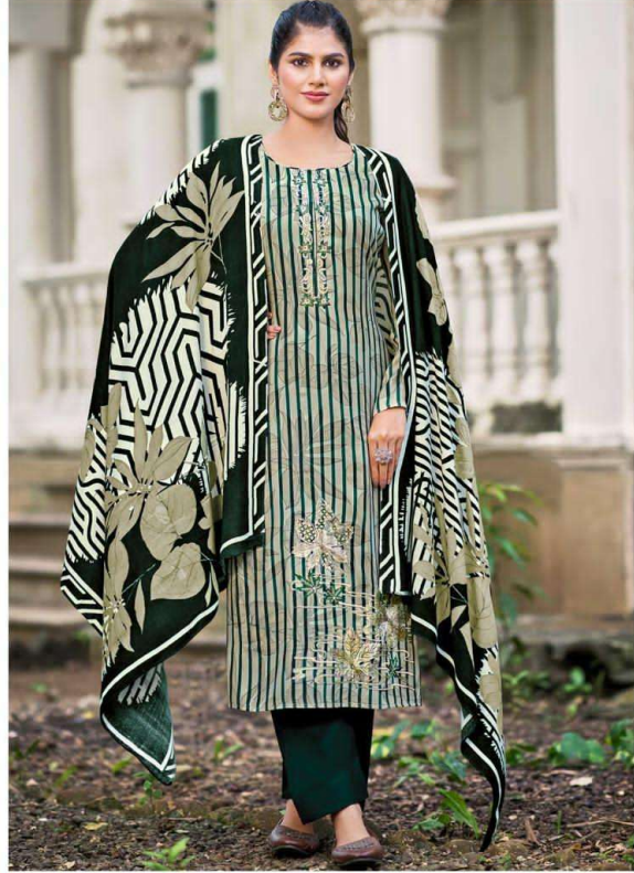
3002 | Hoonar