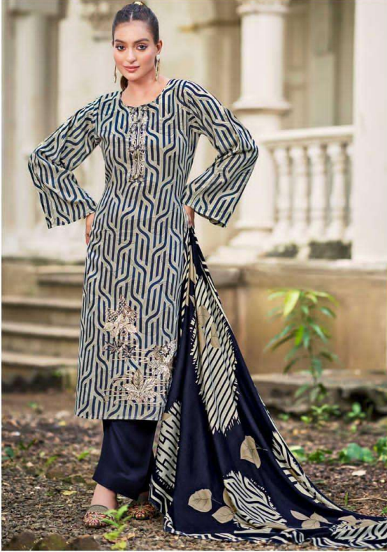
3001 | Hoonar