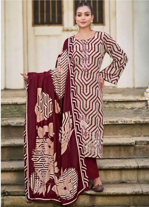
3003 | Hoonar