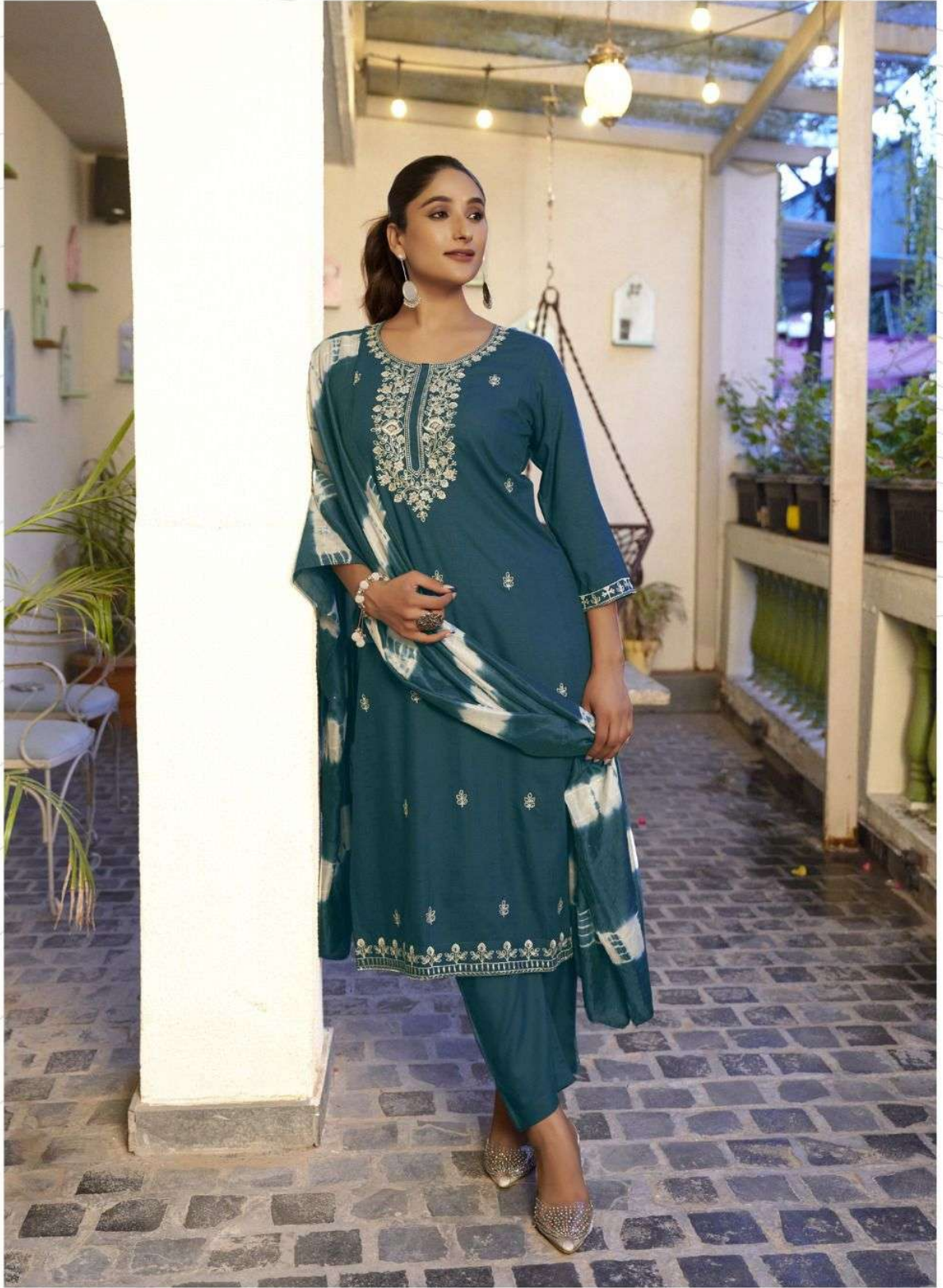
Feeling classy, looking sassy in this suit