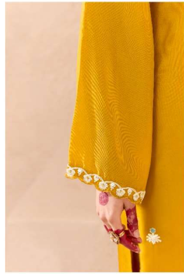
Embroidered kurta with intricate details, showcasing skilled traditional craftsmanship.