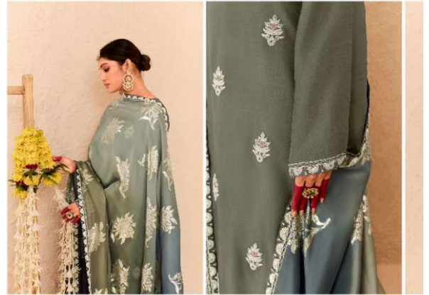
The dress was adorned with sparkling sequins that shimmered in the spotlight