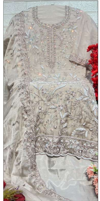
S - 378 D