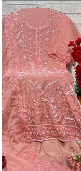
S - 378 C