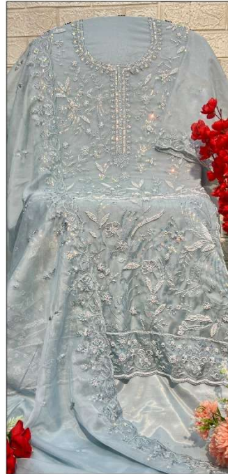
S - 378 B