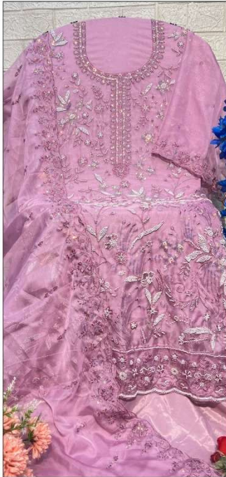
S - 378 A

Dupatta - soft tabby organza heavy embroidery work