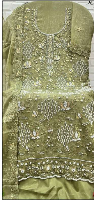
S - 388 C