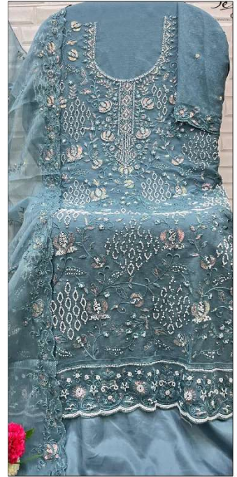
S - 388 D