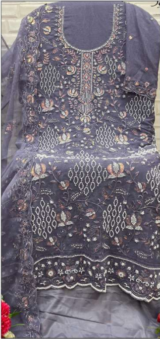
S - 388 A

DUPATTA - CURRENCY HEAVY EMBROIDERY WORK