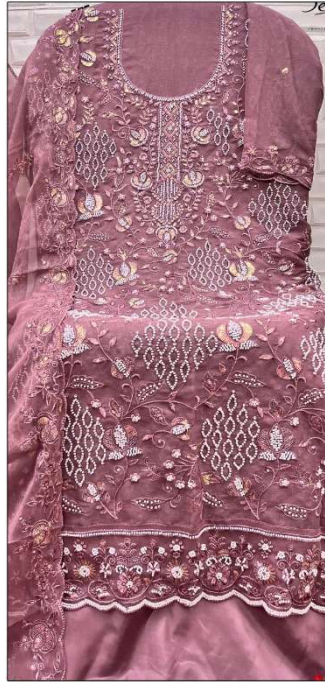
S - 388 B