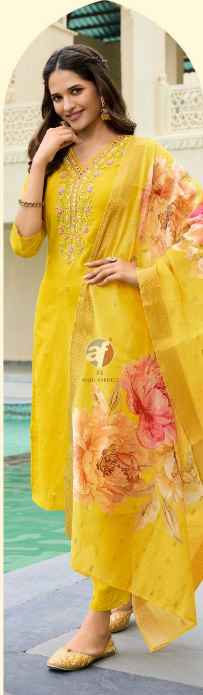
Mayra VOL-5 3 8 5 2