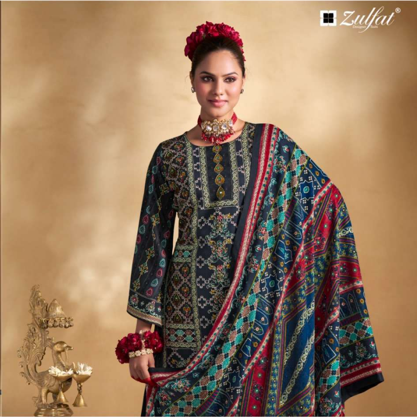
608-005 "What's my style is not your style, and I don't see how you can define it. It's something that expresses who you are in your own way."