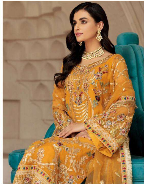
D.NO.130 TOP:- GEORGETTE INNER:- SANTOON BOTTOM:- SANTOON DUPATTA:- NET