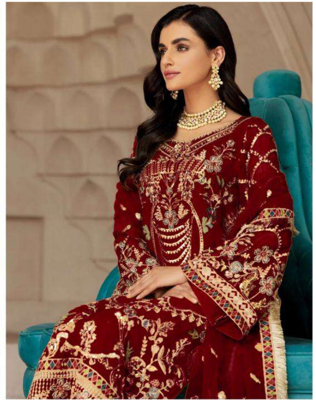
D.NO.130-E TOP:- GEORGETTE INNER:- SANTOON BOTTOM:- SANTOON+ PATCHWORK DUPATTA:- NAZNEEN