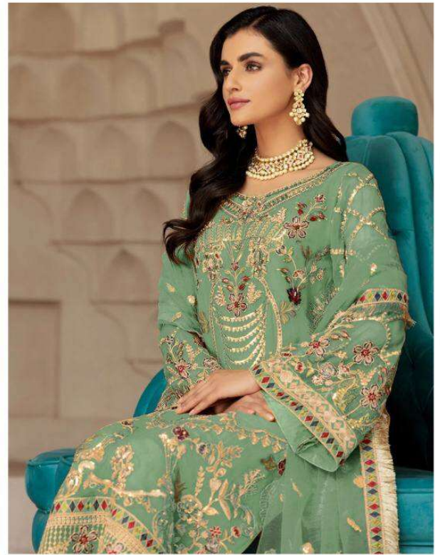
D.NO.130-B TOP:- GEORGETTE INNER:- SANTOON BOTTOM:- SANTOON DUPATTA:- NET