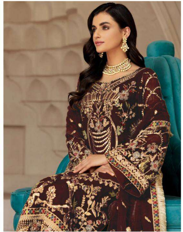
D.NO.130-C TOP:- GEORGETTE INNER:- SANTOON BOTTOM:- SANTOON+ PATCHWORK DUPATTA:- NAZNEEN