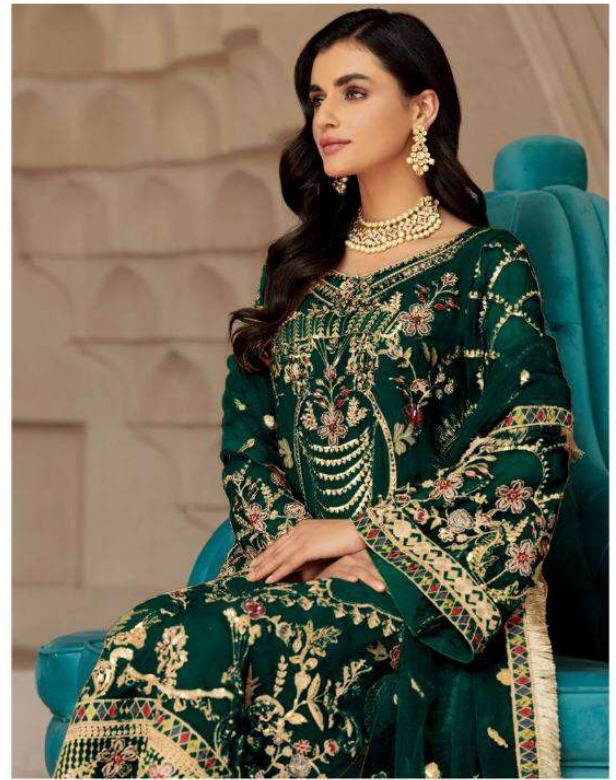
D.NO.130-A TOP:- GEORGETTE INNER:- SANTOON BOTTOM:- SANTOON+ PATCHWORK DUPATTA:- NAZNEEN