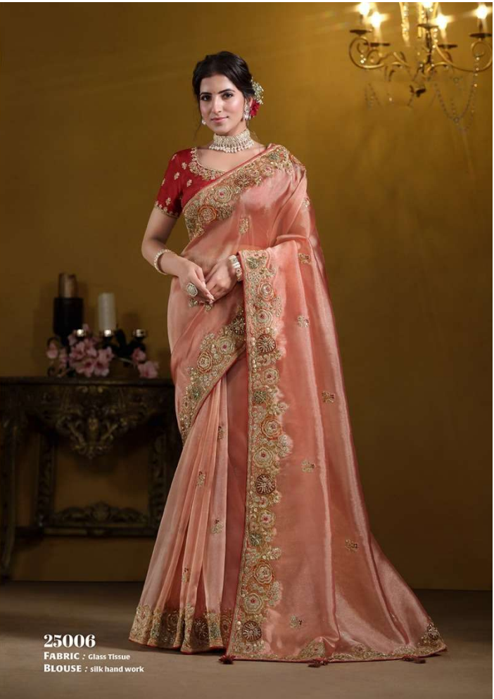
25006 FABRIC : Glass Tissue BLOUSE : silk hand work