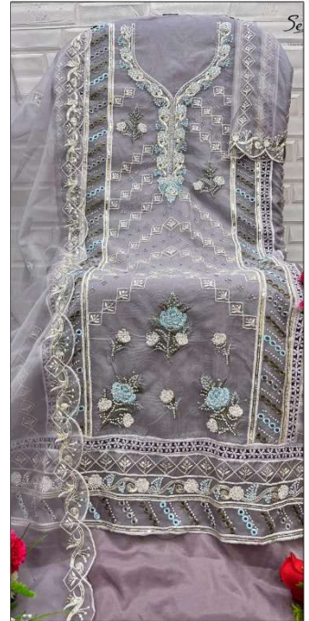
S - 392 D