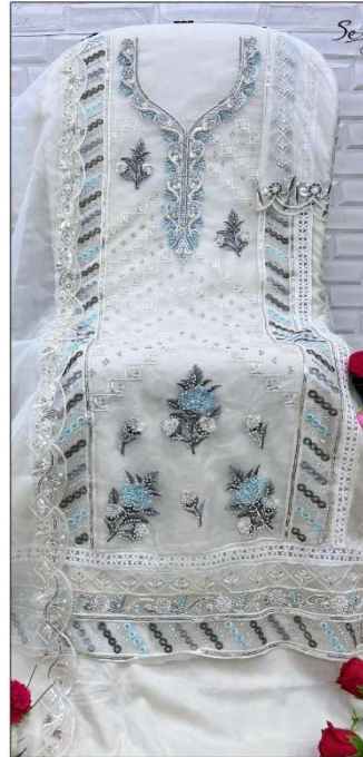
S - 392 B