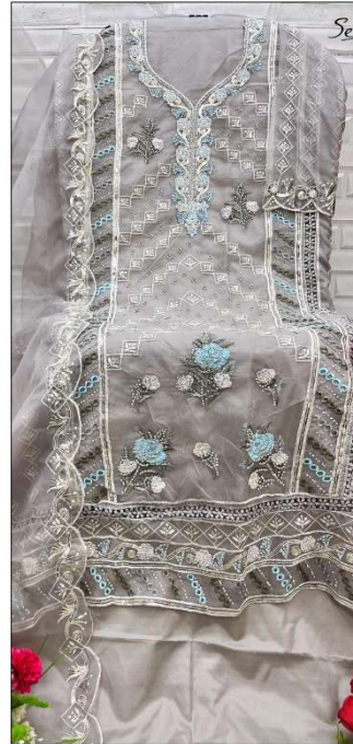
S - 392 C