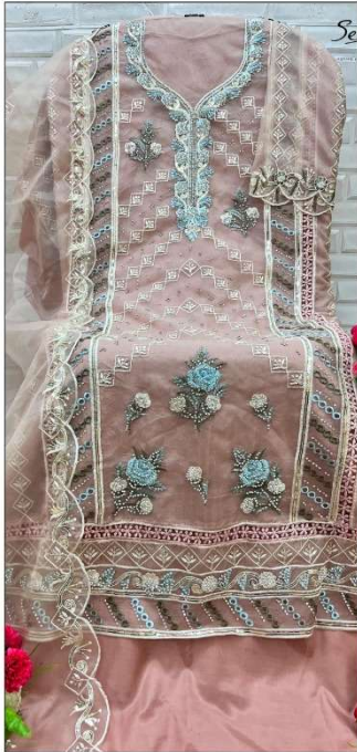
S - 392 A