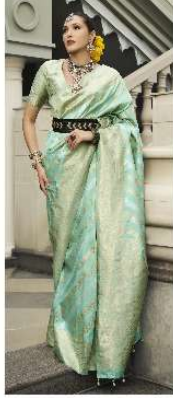
K - 140