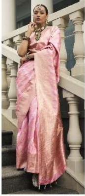
K - 139