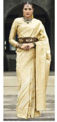
K - 143