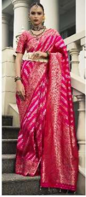
K - 138