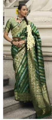
K - 142