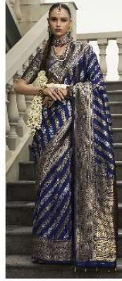
K - 141