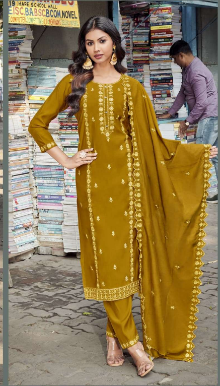
~ D.NO. 1003 ~