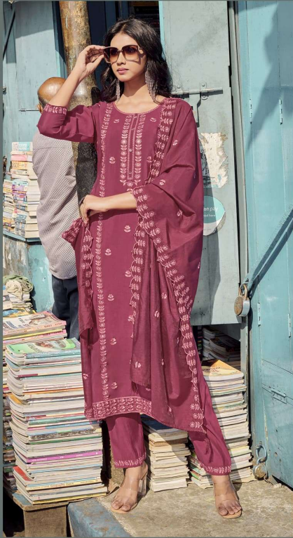
~ D.NO. 1001 ~