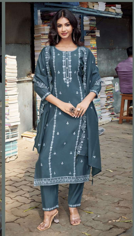
~ D.NO. 1006 ~