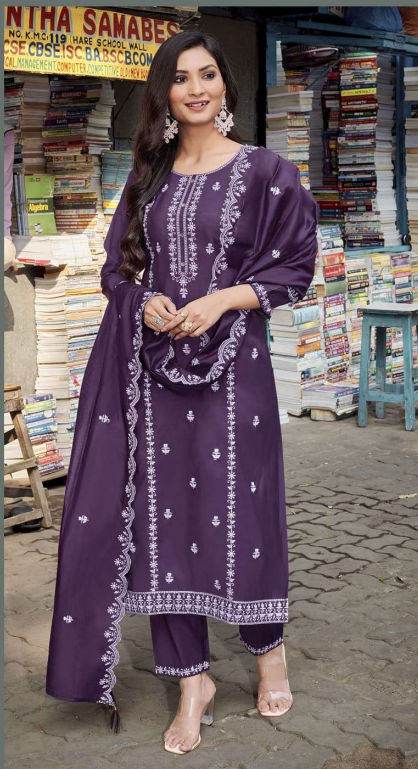
~ D.NO. 1004 ~