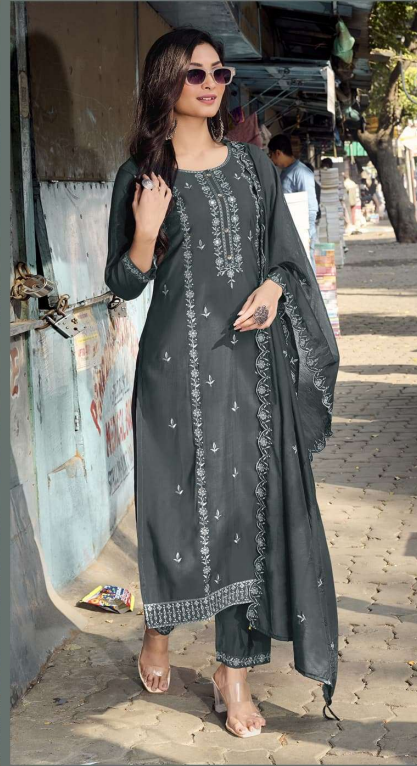
~ D.NO. 1002 ~