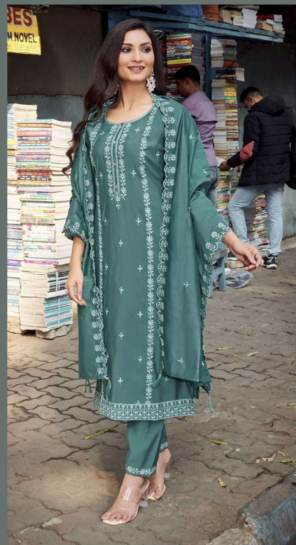
~ D.NO. 1005 ~