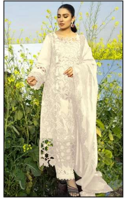
JT D.NO.154 D

DUPATTA :-KOTA CHECKS WITH HEAVY EMBROIDERED