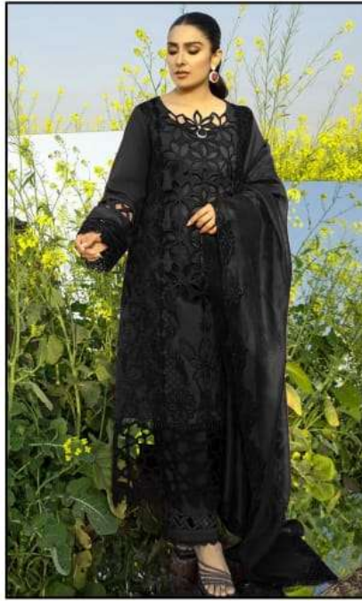
JT D.NO.154 C

TOP:- CAMBRIC COTTON WITH HEAVY EMBROIDERY WORK WITH (PERALS MOTI WORK)