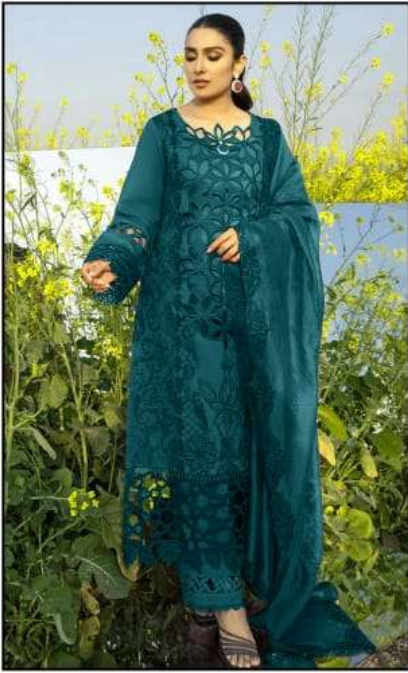
JT D.NO.154 B

TOP:- CAMBRIC COTTON WITH HEAVY EMBROIDERY WORK WITH (PERALS MOTI WORK)