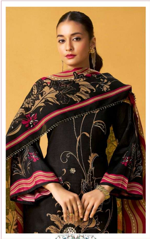
"What you wear is how you present yourself to the world, especially today, when human contacts are so much. Fashion is silent language!" 623-002