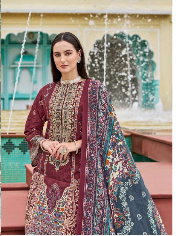
1027-002 "Fashy offers an alternate way of being, crossing and merging masculine and feminine."