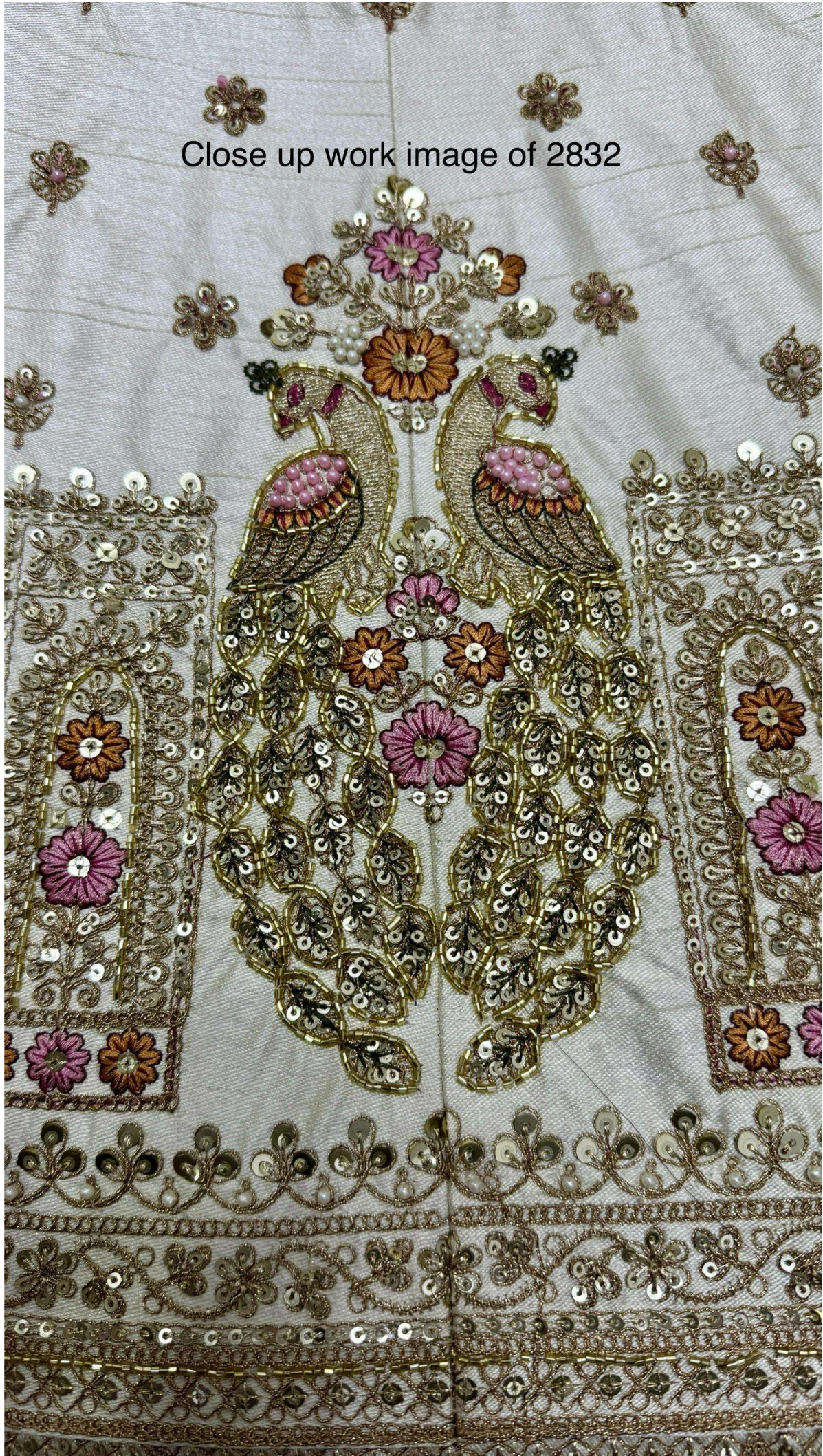
Close up work image of 2832