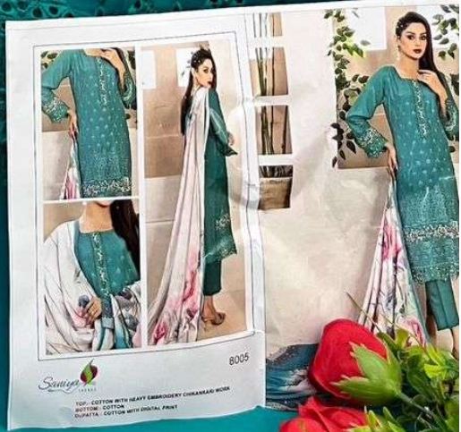
Saniya TRENDZ 8005 TOP - COTTON WITH HEAVY EMBROIDERY CHINARAWA WIDE BOTTOM - COTTON DUPATTA - COTTON WITH DIGITAL PRINT