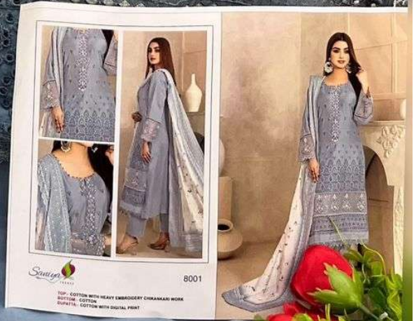
8001 TOP: COTTON WITH HEAVY EMBROIDERY CHIKANKARI WORK BOTTOM: COTTON SHEETAL: COTTON WITH DIGITAL PRINT