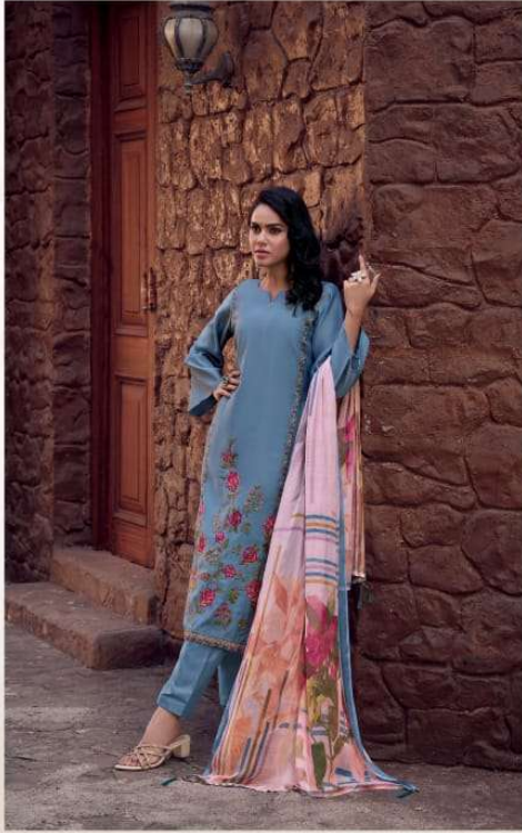
BEAUTIFUL FASHION ALLOW AN ASSORTMENT OF VIBRANT MEDALLIONS OCCASIONS & GEOMETRICS CROWD YOUR WARDROBE