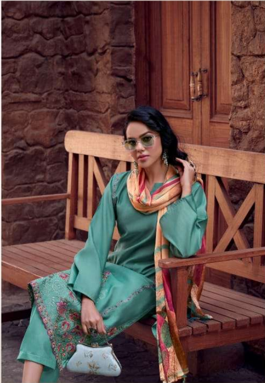
TRADITIONAL THIS FESTIVE SEASON MAKE EVERYDAY FASHIONABLE WITH GREAT RANGE FROM THE EXCLUSIVE COLLECTION