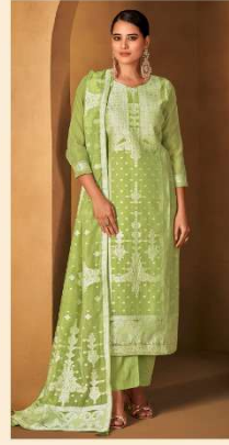
❖ 107-002 ❖