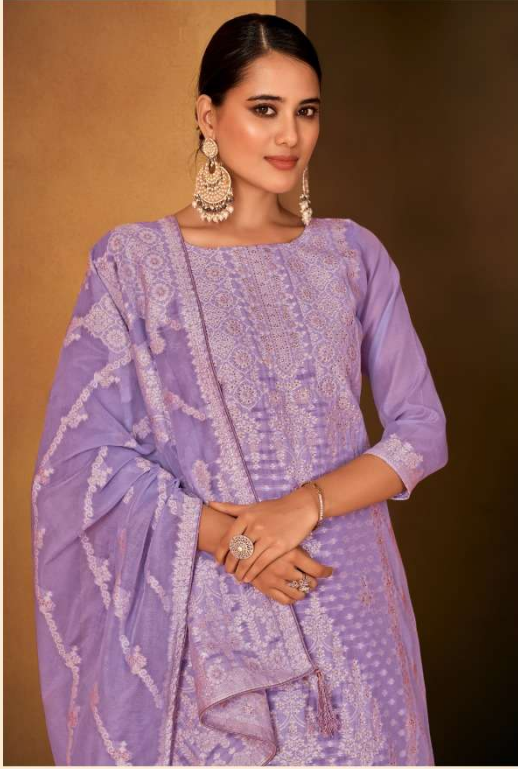
Banarasi Adha Vol-3