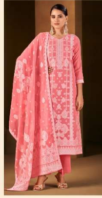
❖ 107-001 ❖