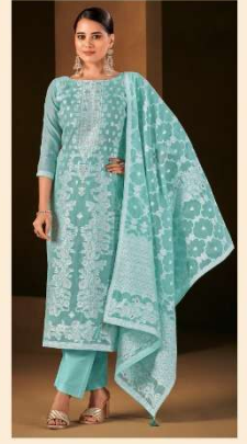
❖ 107-003 ❖