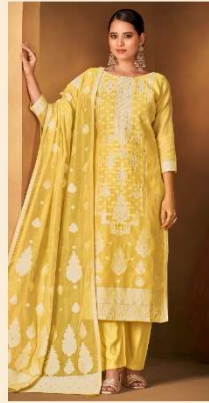
❖ 107-004 ❖