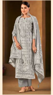
❖ 107-006 ❖