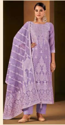
❖ 107-005 ❖