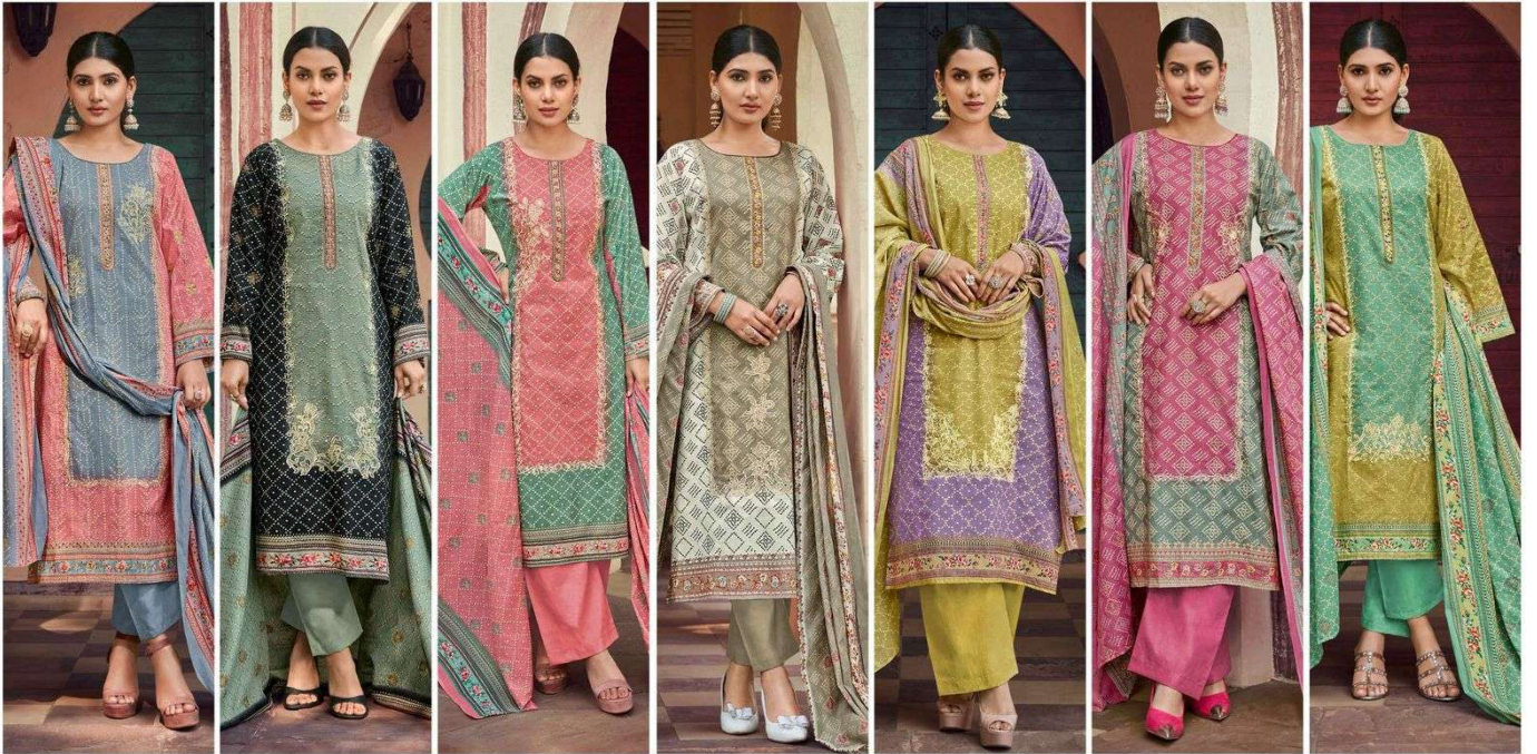
• 1001 •