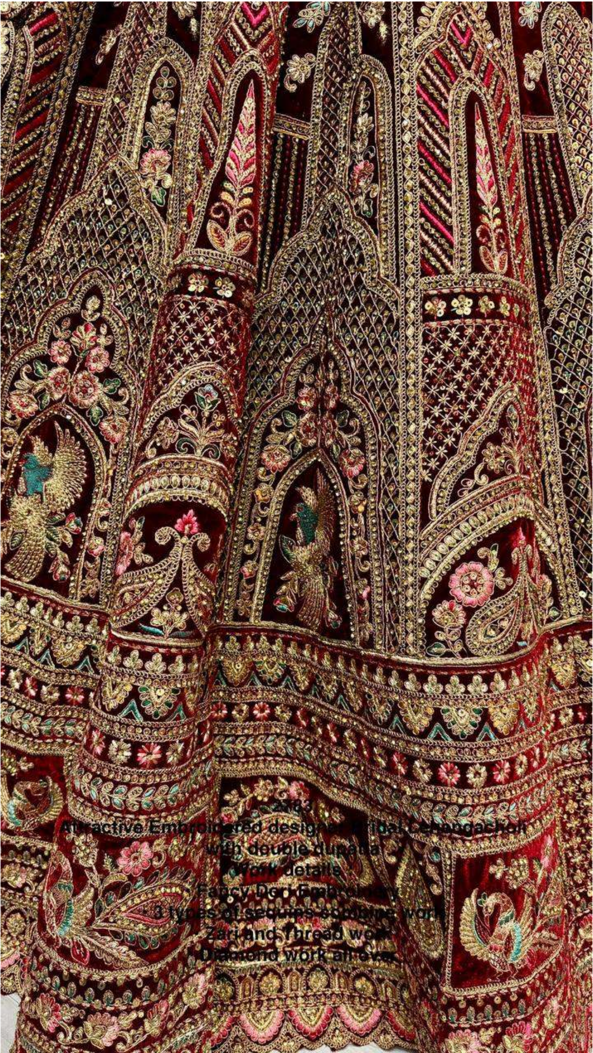
278 Attractive Embroidered design on dark chandgasket with double dupatta Work details Fancy Derk Embroidery 3 types of sequins, gold and silver work Zari and Thread work Diamond work all over