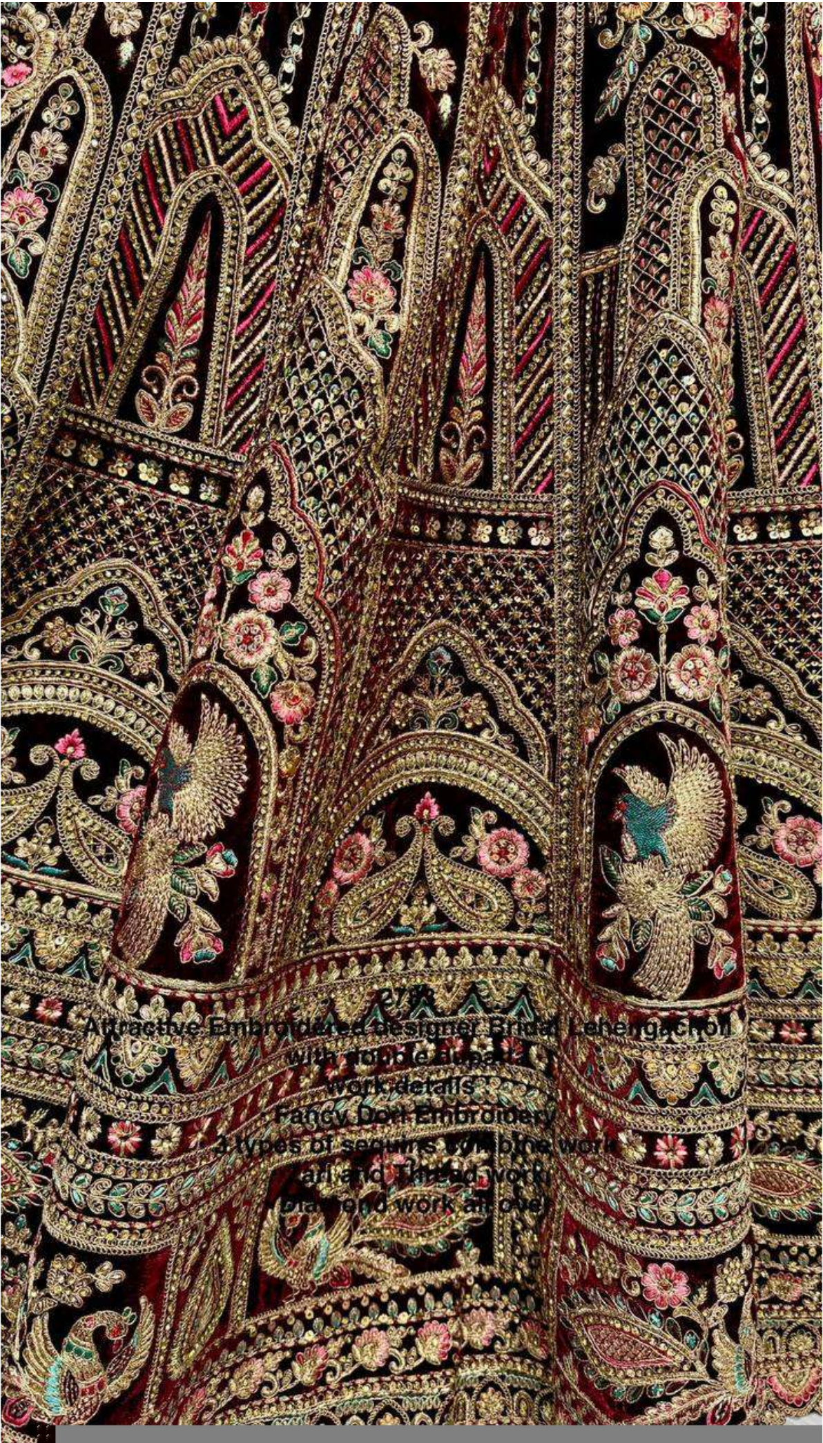
Attractive Embroidered designer Bridal Lehenga Choli with noble floral work details Fancy Dot Embroidery 4 types of sequins combine work and Thread work diamond work all over