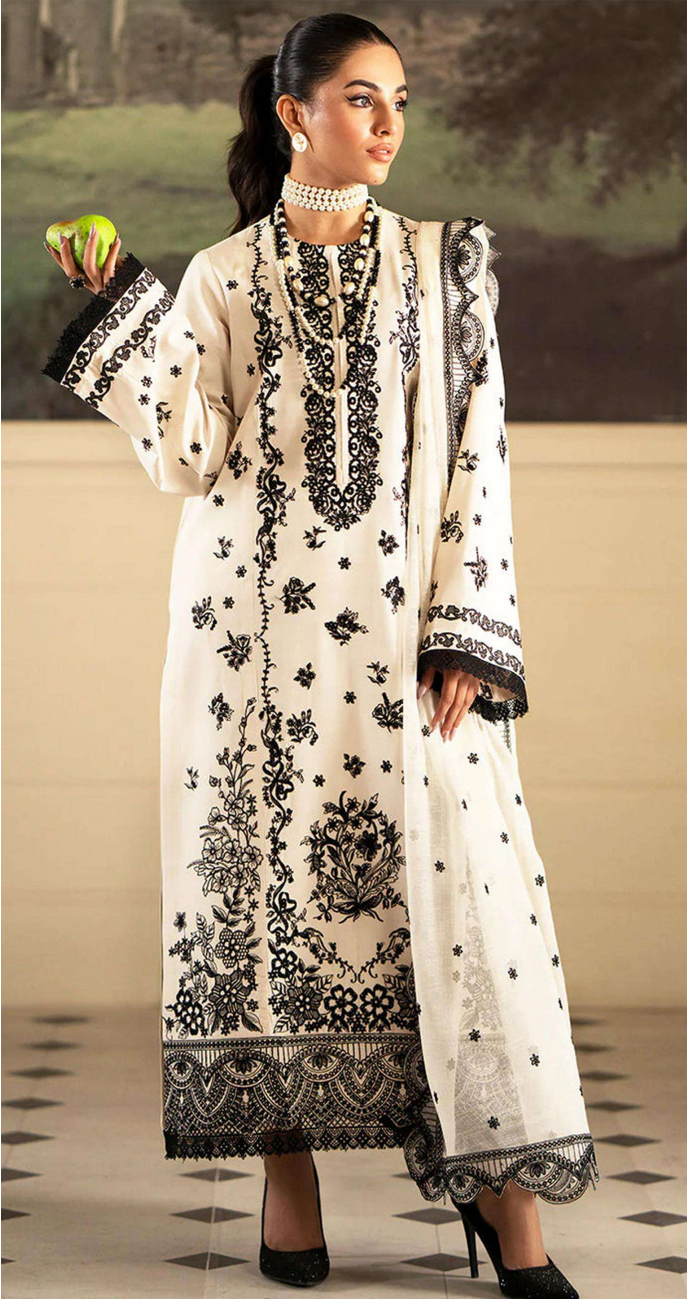
JT D.NO.158 A