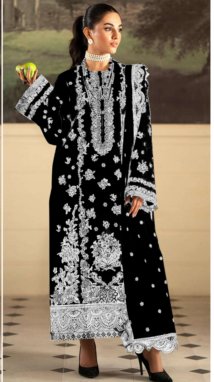
JT D.NO.158 B

TOP :-REYON COTTON HEAVY EMBROIDERED WITH PERALS MOTI WORK) DUPATTA :-KOTA CHECKS HEAVY EMBROIDERED BOTTOM:-REYON COTTON