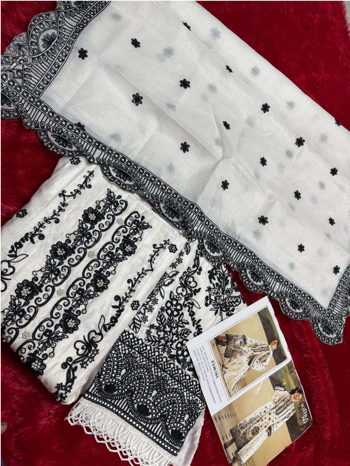
TJ No. 18A TOP: 100% COTTON, 100% EMBROIDERED WITH DUPLOE, 2% POLYESTER, 98% COTTON BOTTOM: 100% COTTON