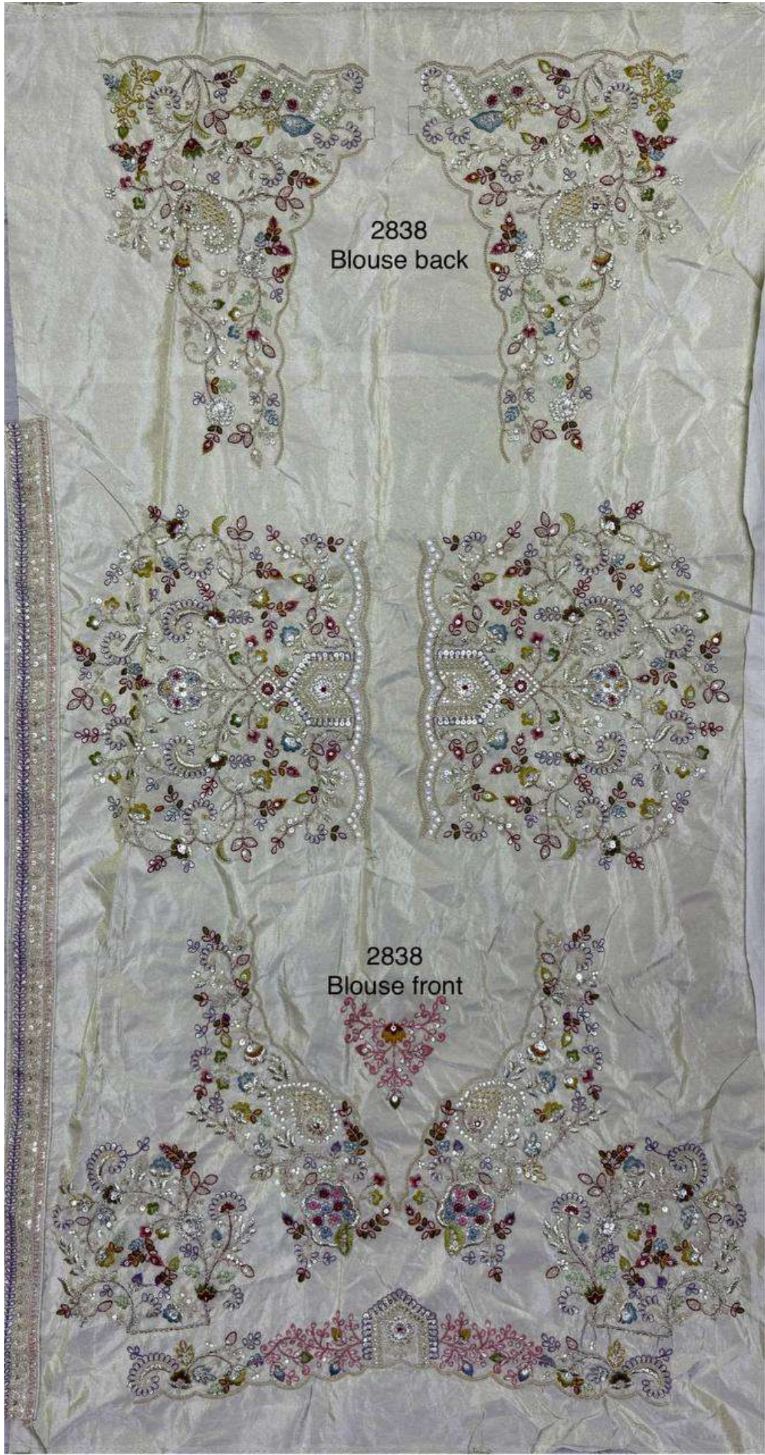
2838 Blouse back