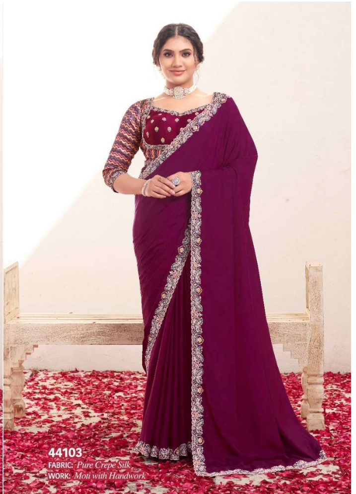
44103 FABRIC: Pure Crepe Silk WORK: Moti with Handwork