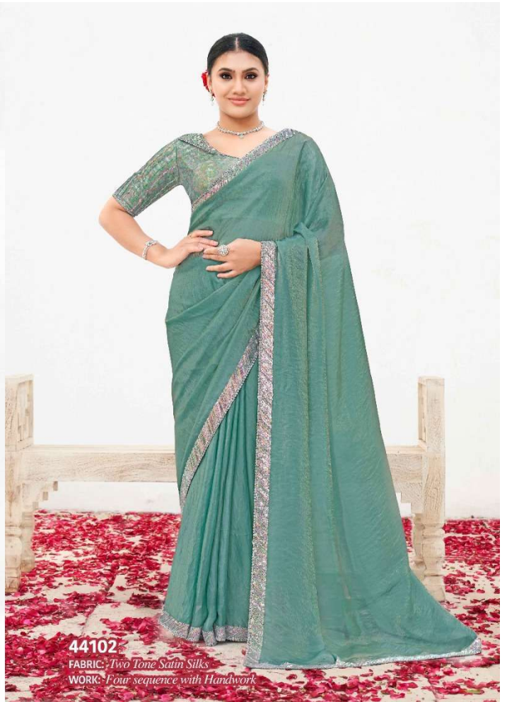
44102 FABRIC: Two Tone Satin Silks WORK: Four sequence with Handwork