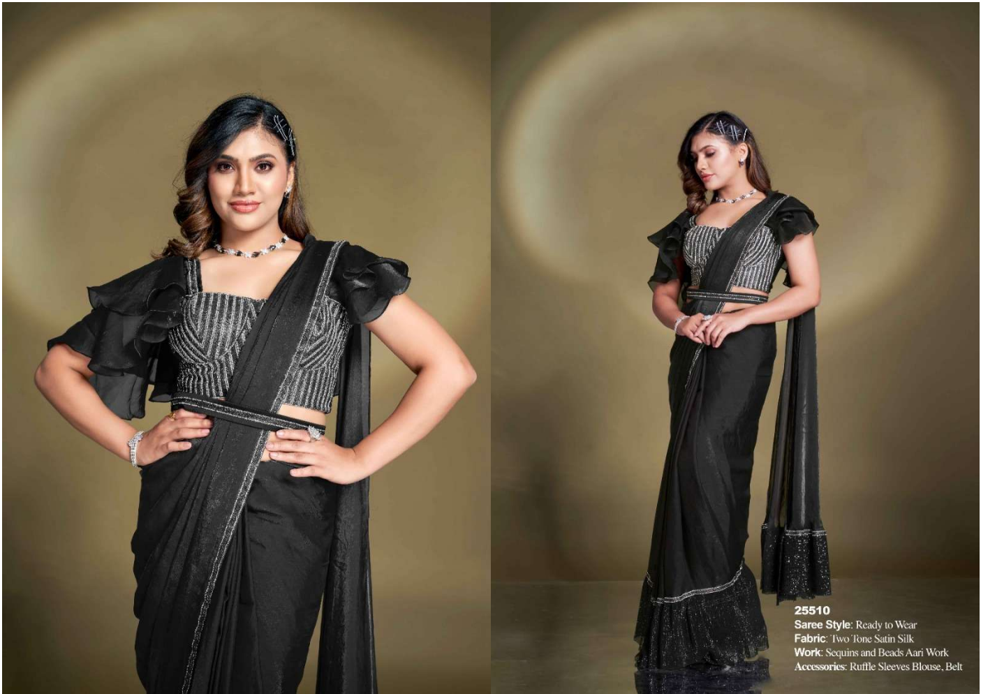
25510 Saree Style: Ready to Wear Fabric: Two Tone Satin Silk Work: Sequins and Beads Aari Work Accessories: Ruffle Sleeves Blouse, Belt