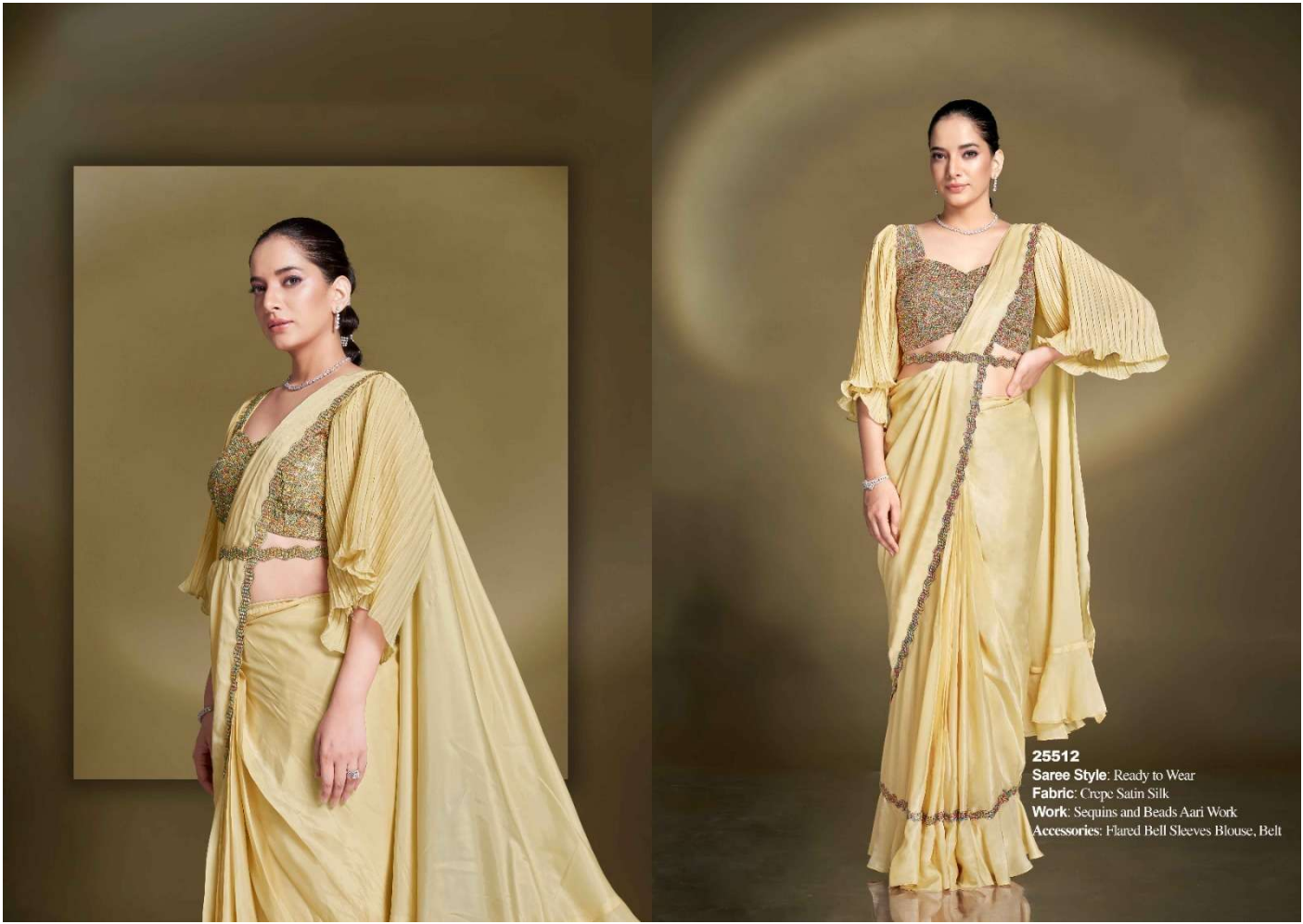
25512 Saree Style: Ready to Wear Fabric: Crepe Satin Silk Work: Sequins and Beads Aari Work Accessories: Flared Bell Sleeves Blouse, Belt