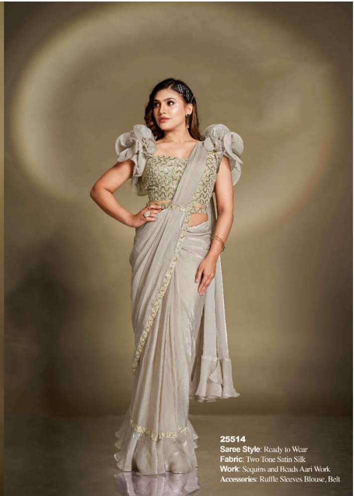
25514 Saree Style: Ready to Wear Fabric: Two Tone Satin Silk Work: Sequins and Beads Aari Work Accessories: Ruffle Sleeves Blouse, Belt