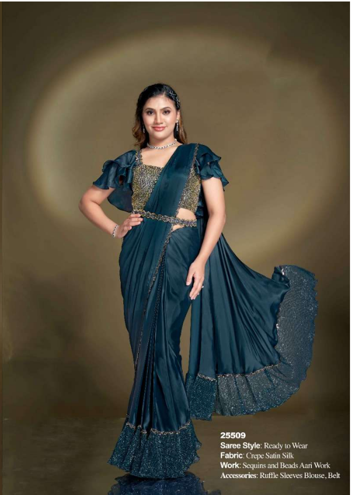
25509 Saree Style: Ready to Wear Fabric: Crepe Satin Silk Work: Sequins and Beads Aari Work Accessories: Ruffle Sleeves Blouse, Belt