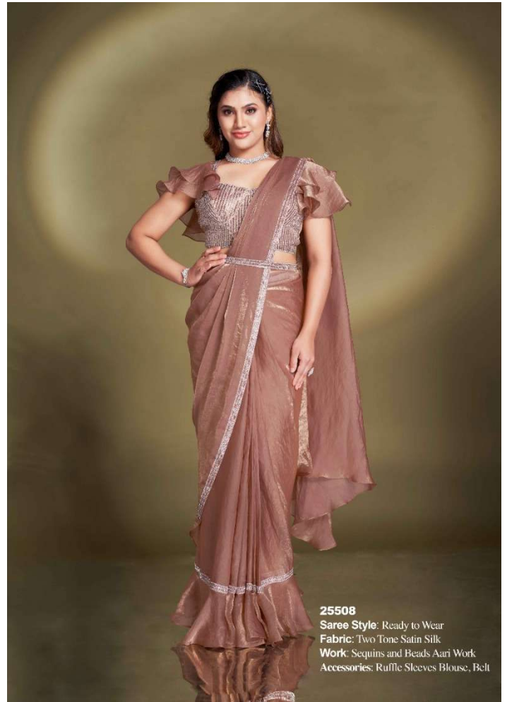
25508 Saree Style: Ready to Wear Fabric: Two Tone Satin Silk Work: Sequins and Beads Aari Work Accessories: Ruffle Sleeves Blouse, Belt