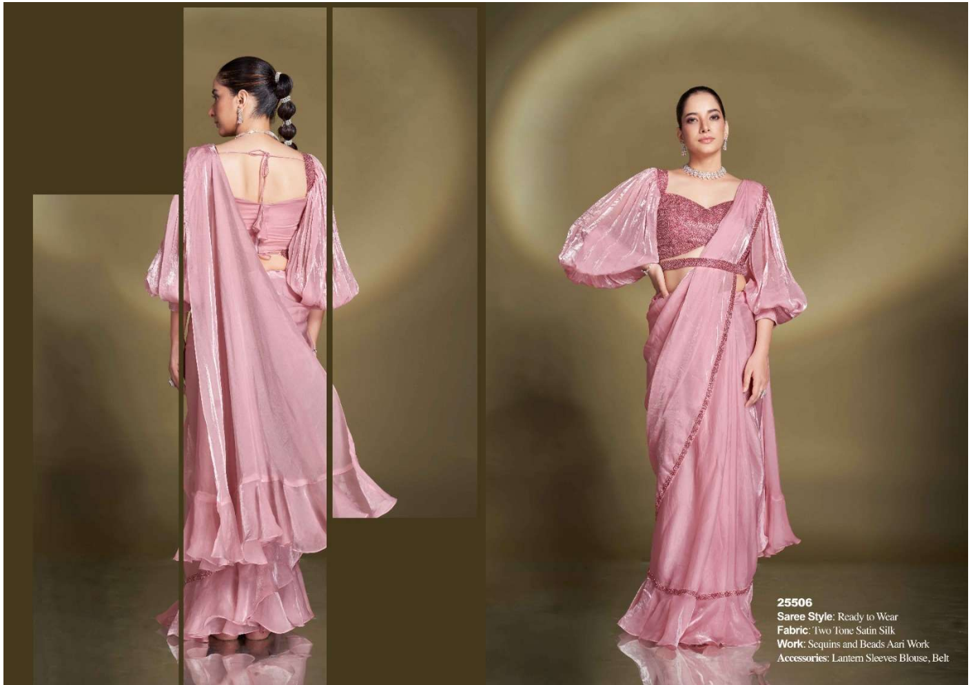
25506 Saree Style: Ready to Wear Fabric: Two Tone Satin Silk Work: Sequins and Beads Aari Work Accessories: Lantern Sleeves Blouse, Belt