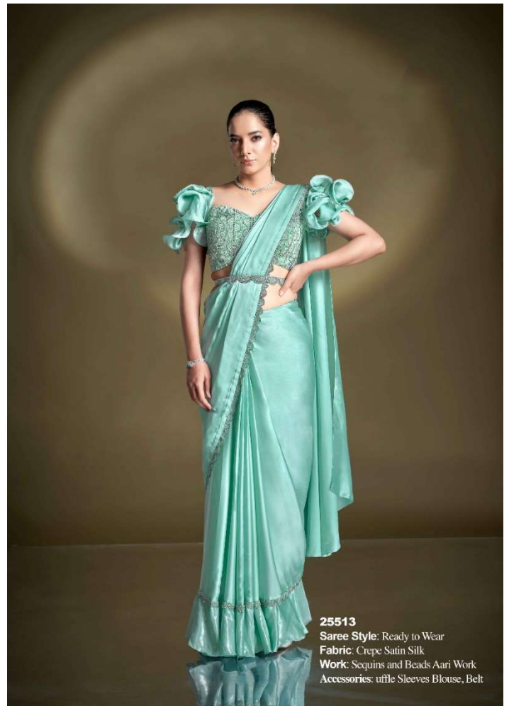
25513 Saree Style: Ready to Wear Fabric: Crepe Satin Silk Work: Sequins and Beads Aari Work Accessories: tulle Sleeves Blouse, Belt