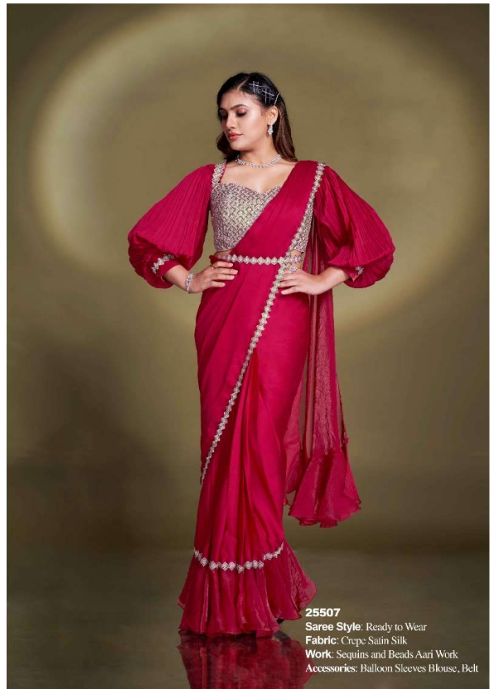
25507 Saree Style: Ready to Wear Fabric: Crepe Satin Silk Work: Sequins and Beads Aari Work Accessories: Balloon Sleeves Blouse, Belt