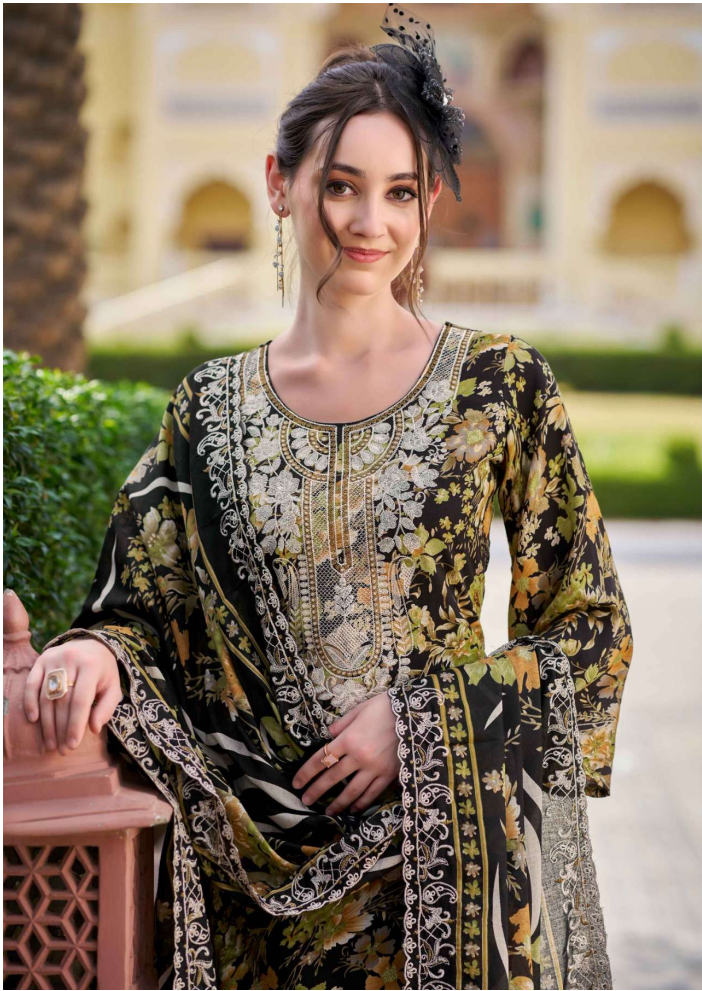
Threads of tradition, woven with today's soul.