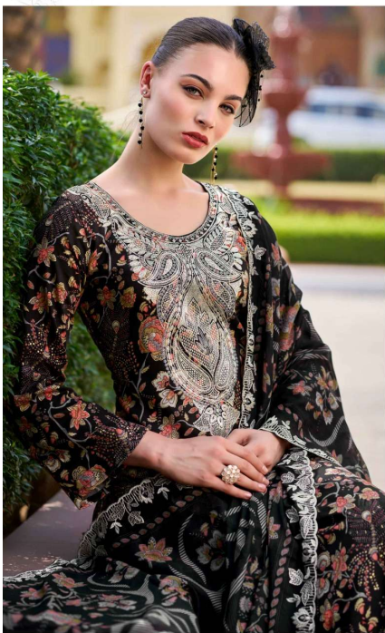
A canvas of fabric, painted with legacy.