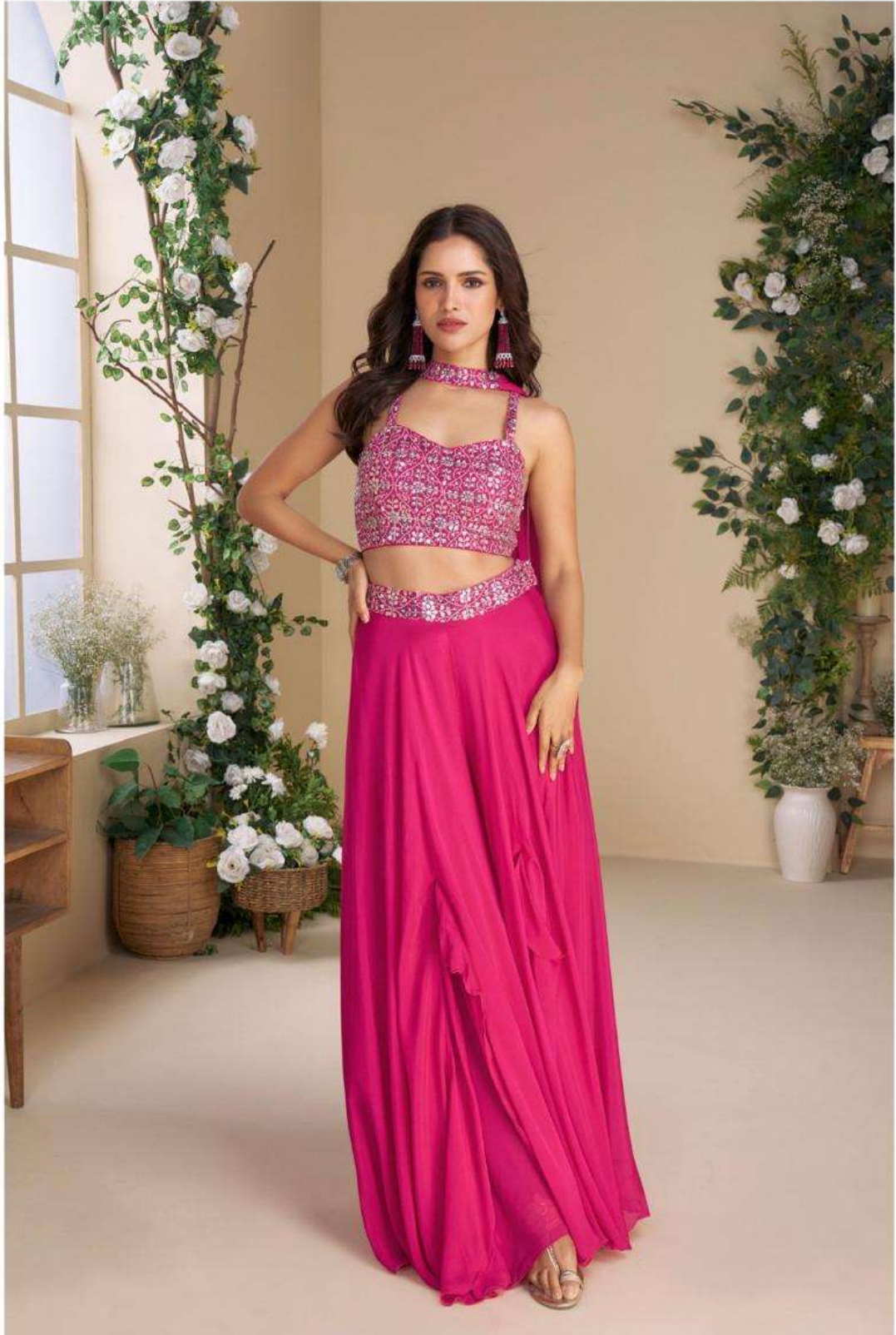
A fresh wave of florals found their way onto the runway. Embrace statement-making look with delicate blooms.