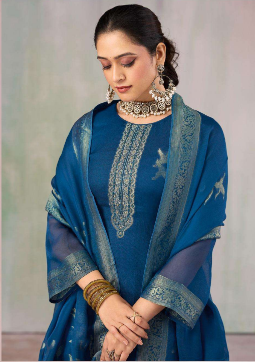
Draped in the richness of tradition, whispered with subtle elegance 2403