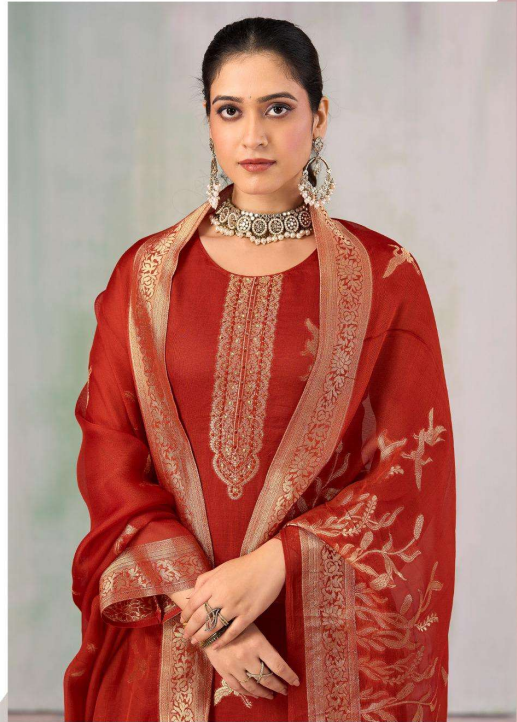
Draped in the richness of tradition, whispered with subtle elegance 2404