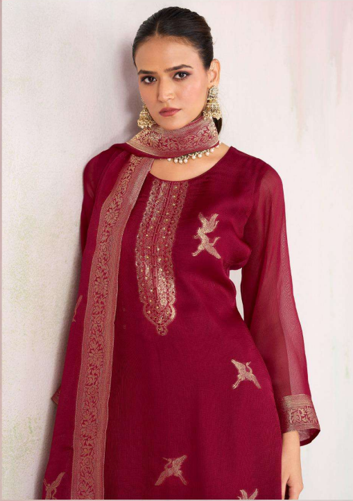
Draped in the richness of tradition, whispered with subtle elegance 2401