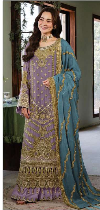
S 645 B