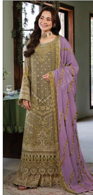
S 645 C