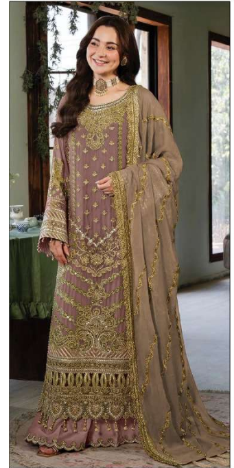
S 645 D