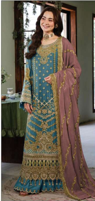
S 645 A

DUPATTA -FOX GEORGETTE HEAVY EMBROIDERY WORK