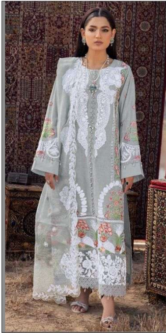
B - 188 A