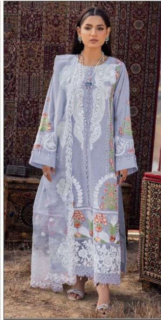
B - 188 C