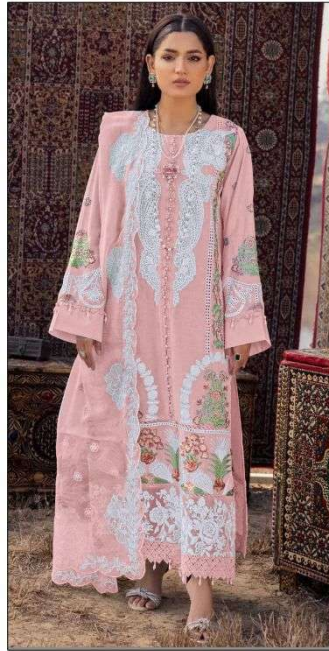
B - 188 B