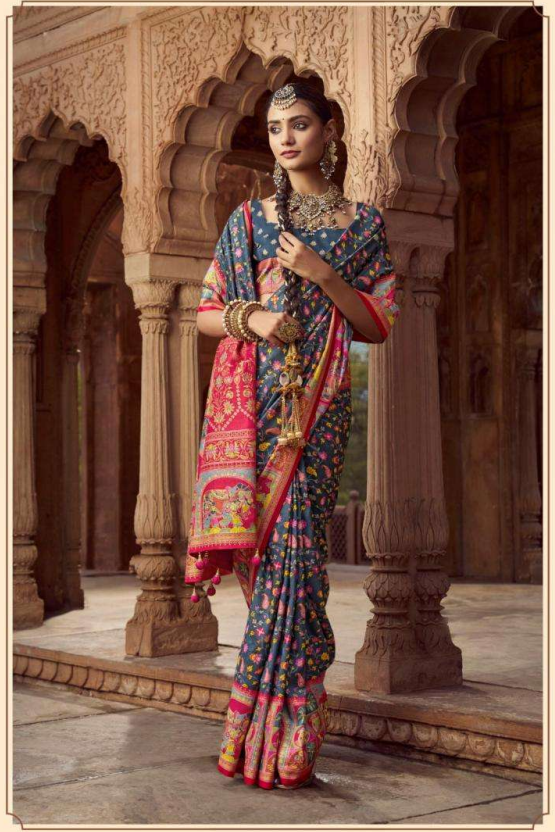
GOLDEN MOTIFS ON MIDNIGHT K 7067 BLUE WITH A ROYAL PALLU.