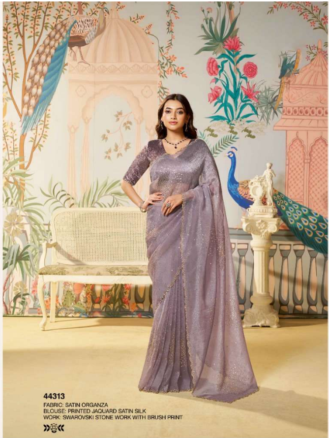
44313 FABRIC: SATIN ORGANZA BLOUSE: PRINTED JACQUARD SATIN SILK WORK: SWAROVSKI STONE WORK WITH BRUSH PRINT