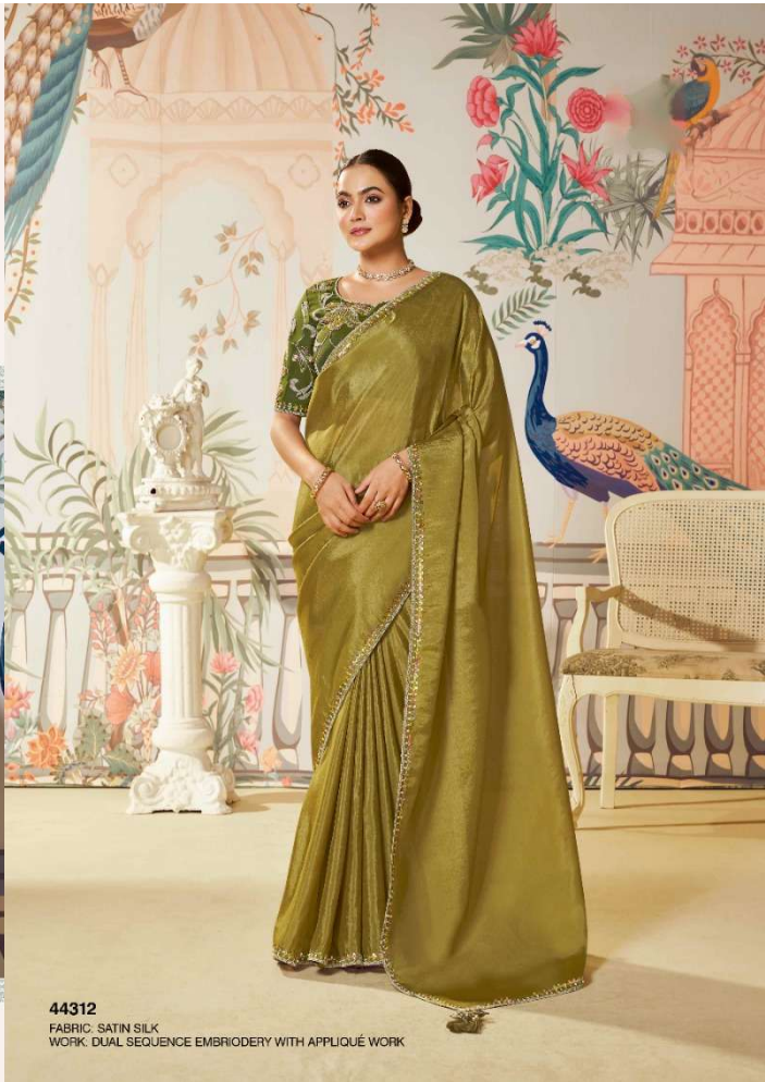
44312 FABRIC: SATIN SILK WORK: DUAL SEQUENCE EMBROIDERY WITH APPLIQUE WORK