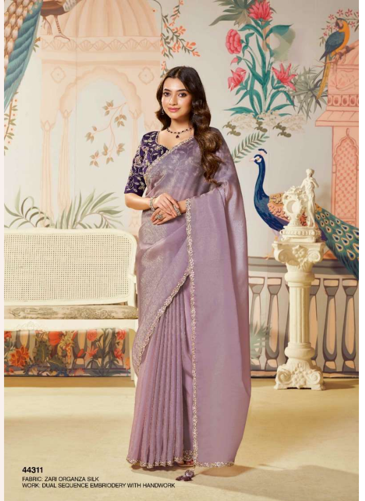
44311 FABRIC: ZARI ORGANZA SILK WORK: DUAL SEQUENCE EMBROIDERY WITH HANDWORK