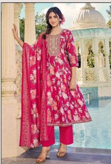
<< 1006 >>