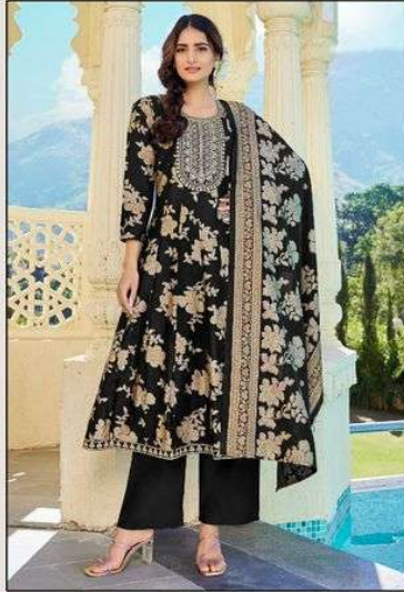
<< 1002 >>