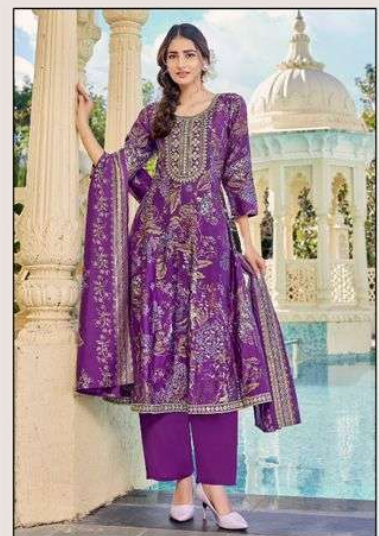
<< 1008 >>