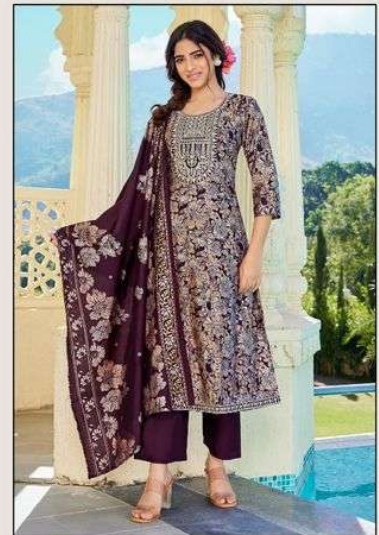
<< 1005 >>