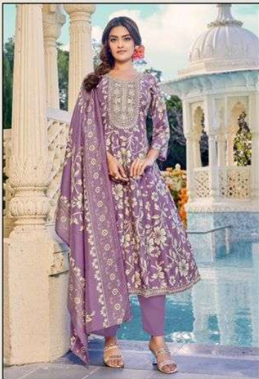
<< 1004 >>