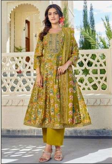
<< 1001 >>