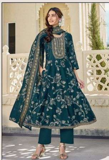
<< 1007 >>