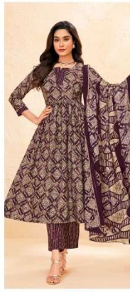
D No. / 209