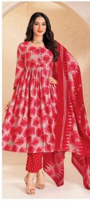
D No. / 207