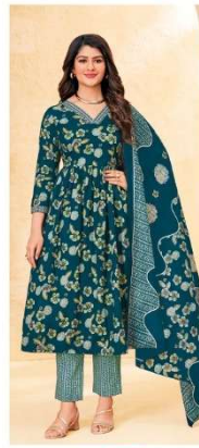
D No. / 214