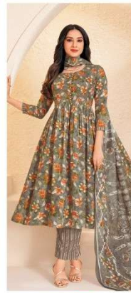
D No. / 215