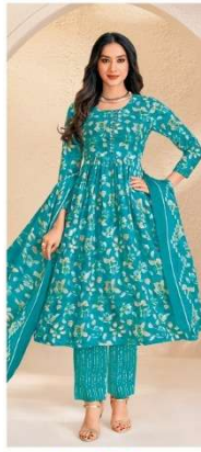
D No. / 208