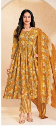
D No. / 210