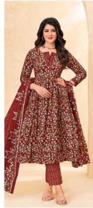
D No. / 216