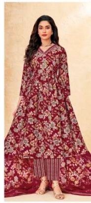
D No. / 213