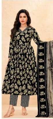
D No. / 211