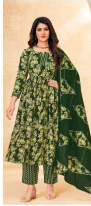
D No. / 212