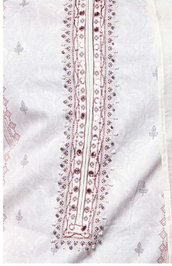
simple without losing so of elegance & tradition with natural fibres.