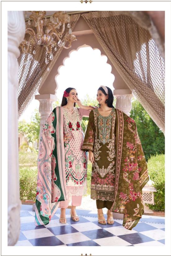
"Fashion you can buy, but style you possess. The key to style is learning who you are, which takes years. There's no how-to road map to style. It's about self expression and, above all, attitude."