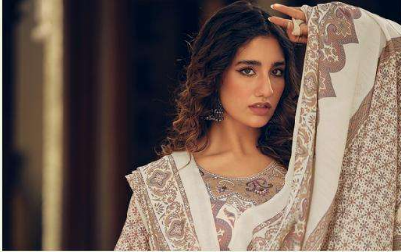
Sanna redefines summer dressing with flowing silhouettes, delicate fabrics, and nature-inspired colors that reflect comfort, beauty, and quiet elegance.