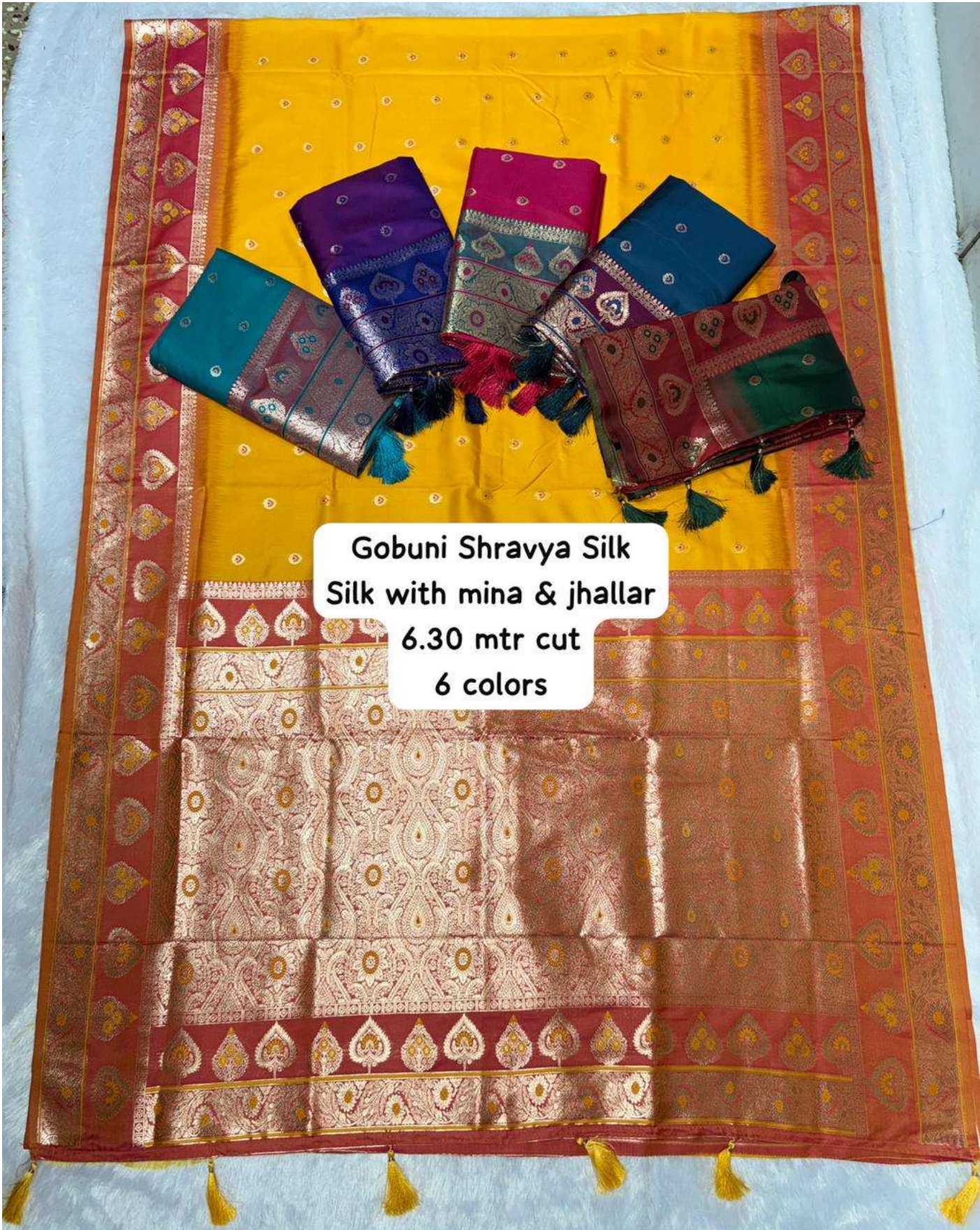
Gobuni Shravya Silk Silk with mina & jhallar 6.30 mtr cut 6 colors