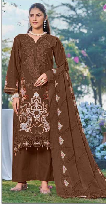
D NO 27002 A