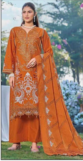
D NO 27002