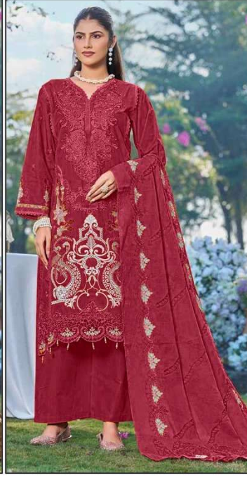
D NO 27002 B