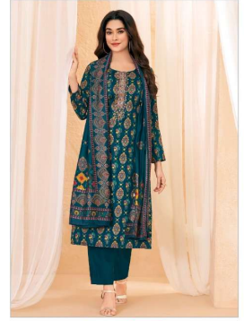
D No. / 014