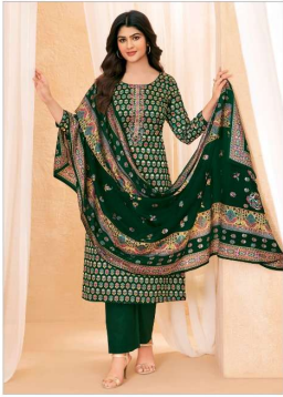
D No. / 009