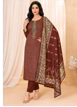
D No. / 013