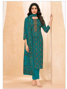
D No. / 016