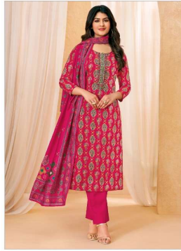
D No. / 010