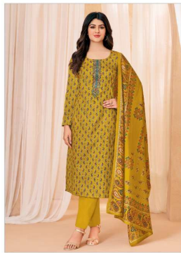
D No. / 012