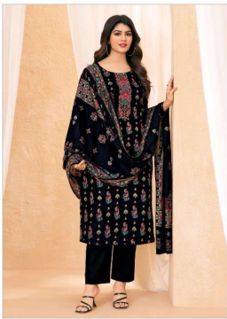
D No. / 011