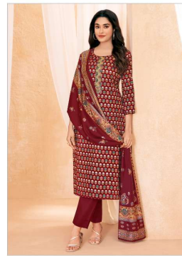
D No. / 015